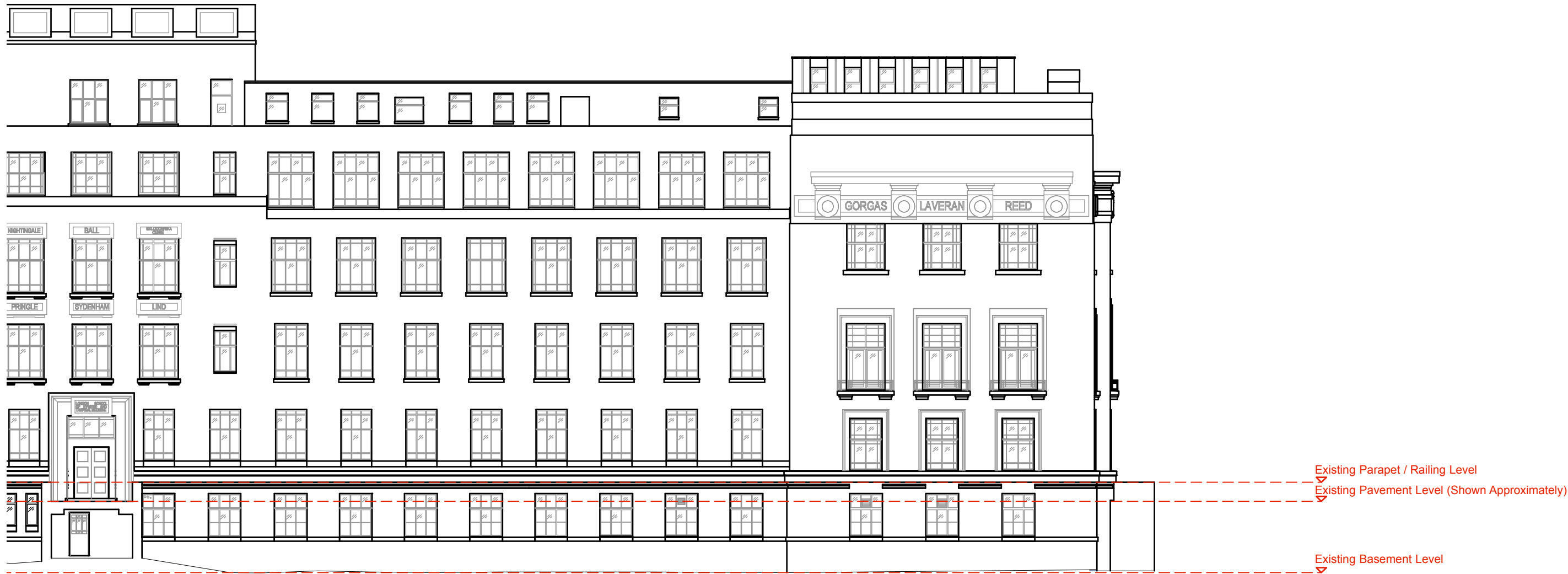
1 Gower Street: Part Existing Elevation 1:200@A3