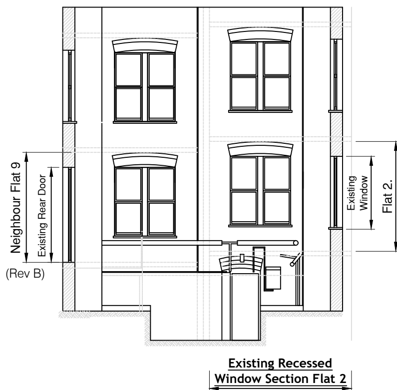
Existing Recessed Window Section Flat 2