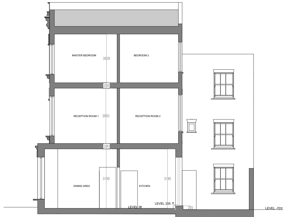
EXISTING SECTION A-A