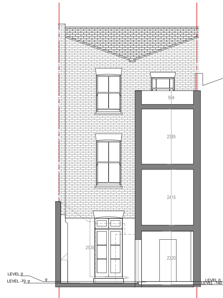
EXISTING SECTION B-B