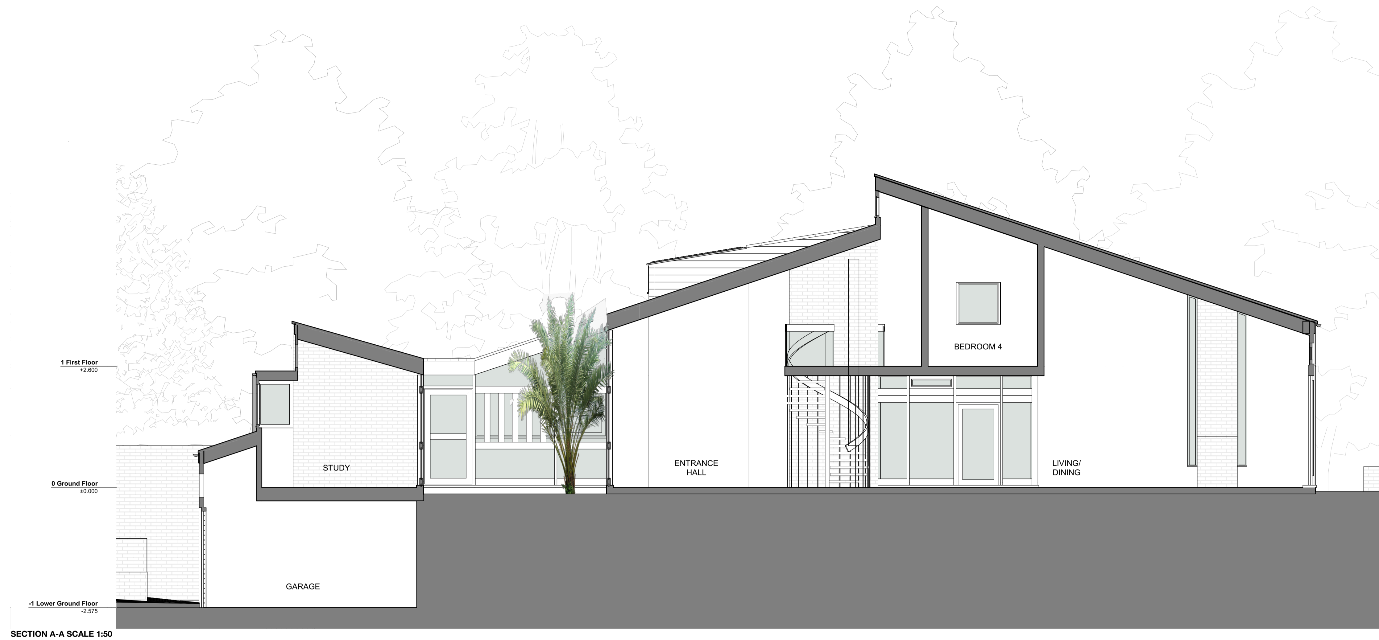
SECTION A-A SCALE 1:50