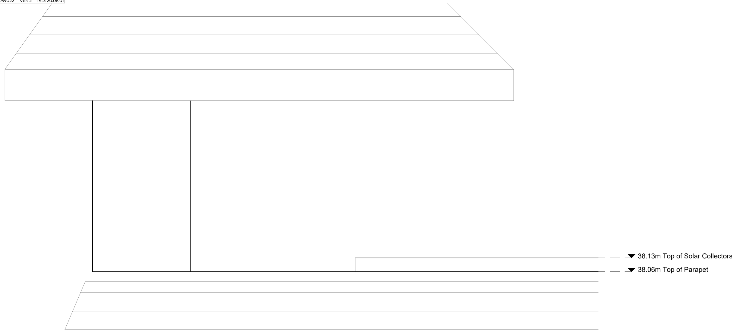
Detail 1: Close-Up of Proposed Solar Collectors