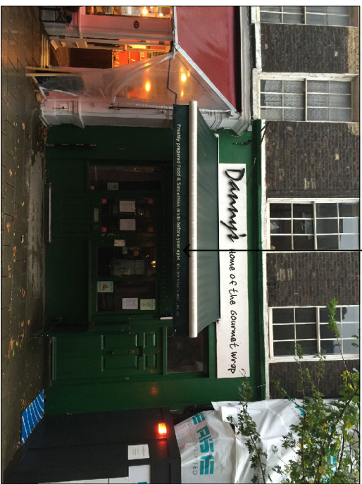
Photograph Showing Existing Front Elevation