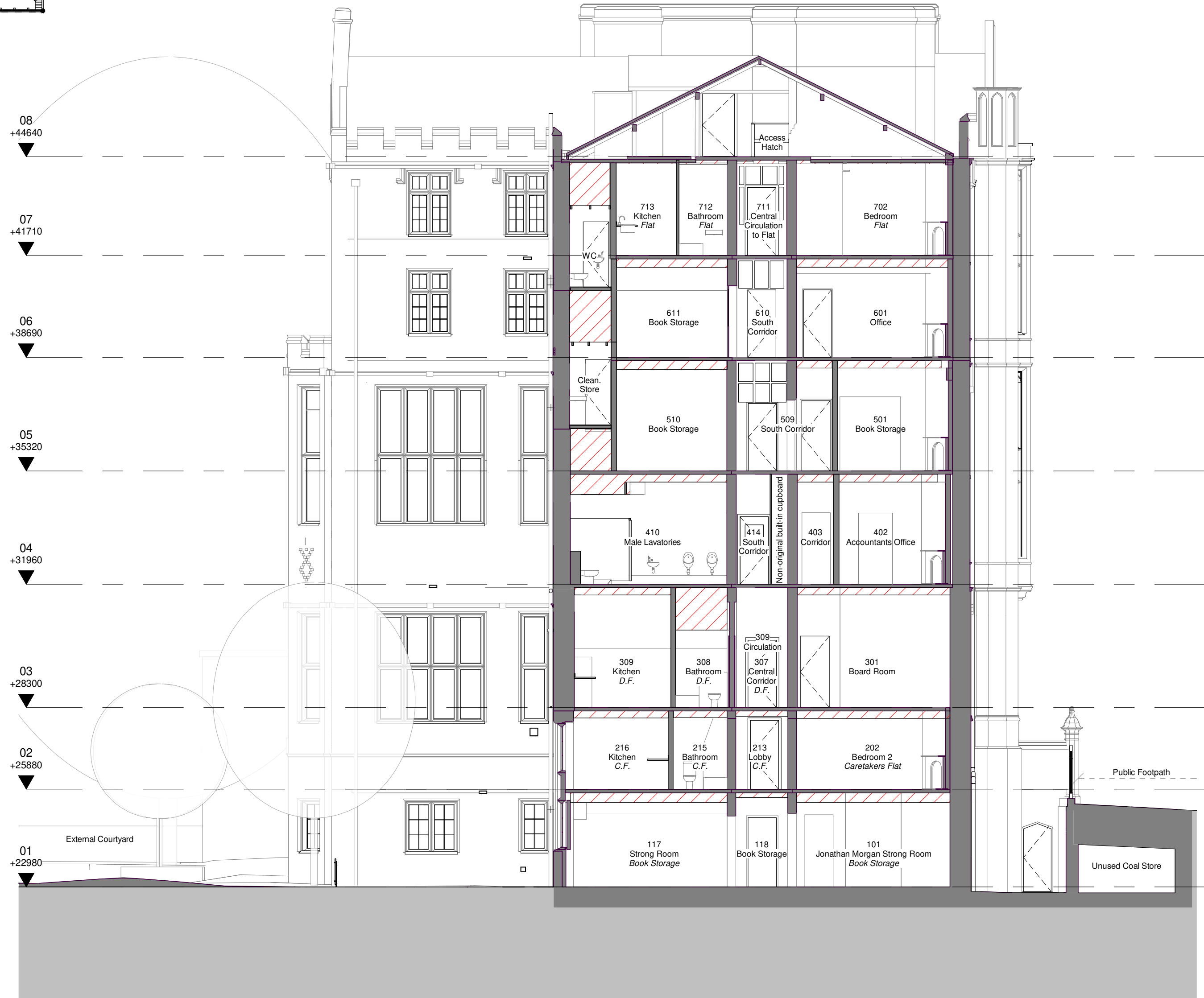
Existing - Section 3 1 : 100

Drawing based on survey information, Revit model and CAD drawings produced by City Survey's and Survey Hub, refer to below files. CPMG cannot be held responsible for any discrepancies within the original Revit survey or CAD drawings. - 10410E_R (City Surveys) - CSDr 000765-DWL-SU-DRG-0001-A01.rvt (City Surveys) - 3916_Dr Williams Library_3D Model (Survey Hub)