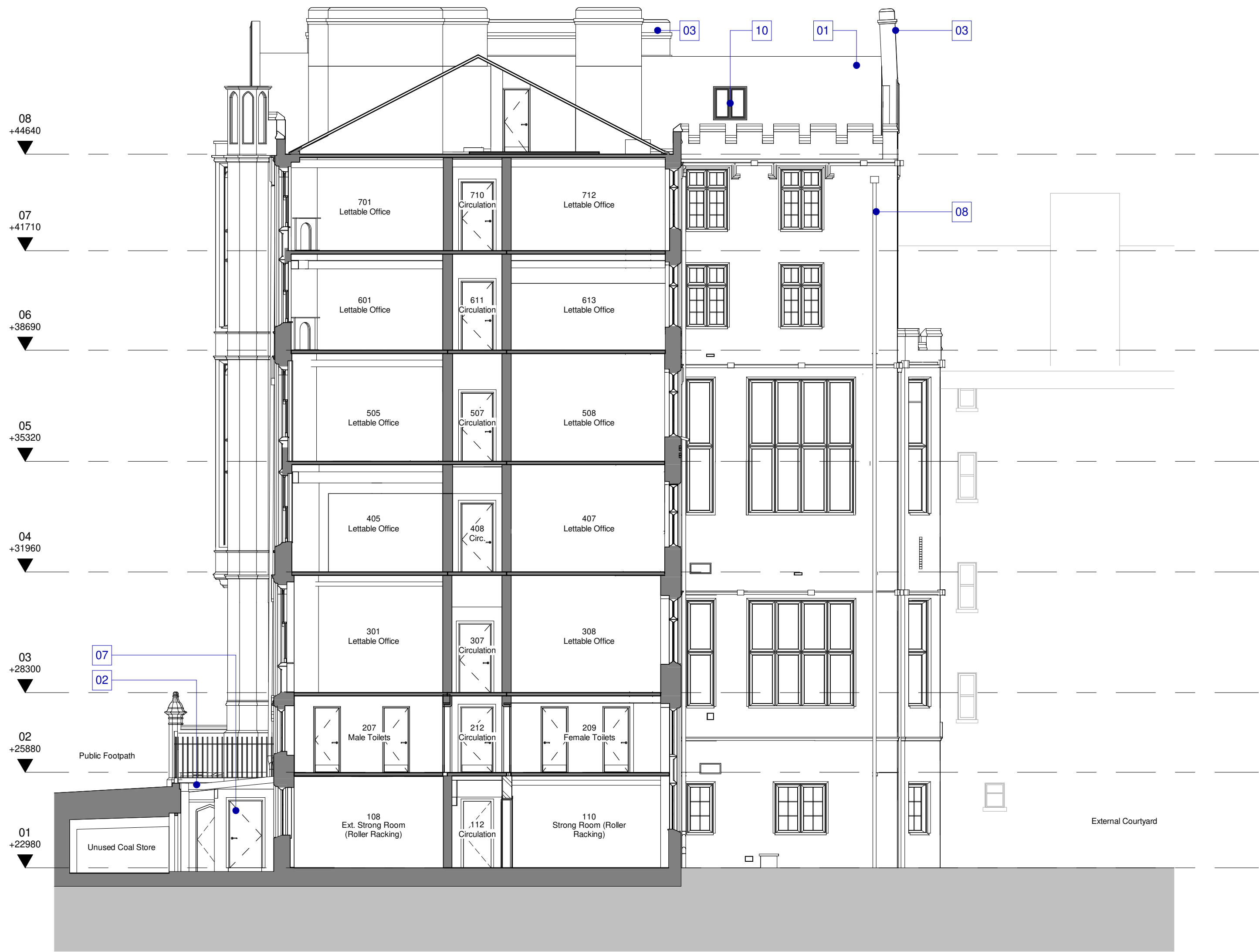
GA Elevation - Central Wing B 1 : 100