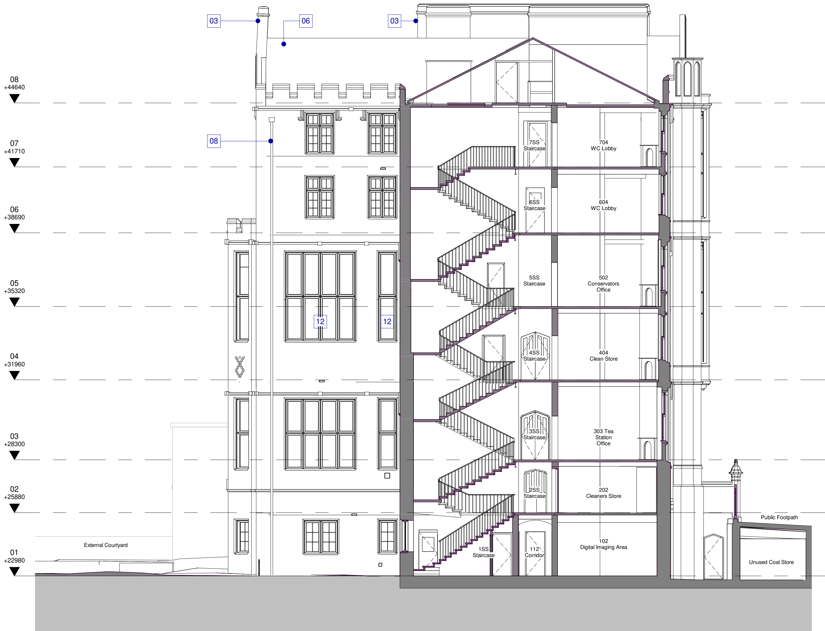
GA Elevation - Central Wing A 1 : 100