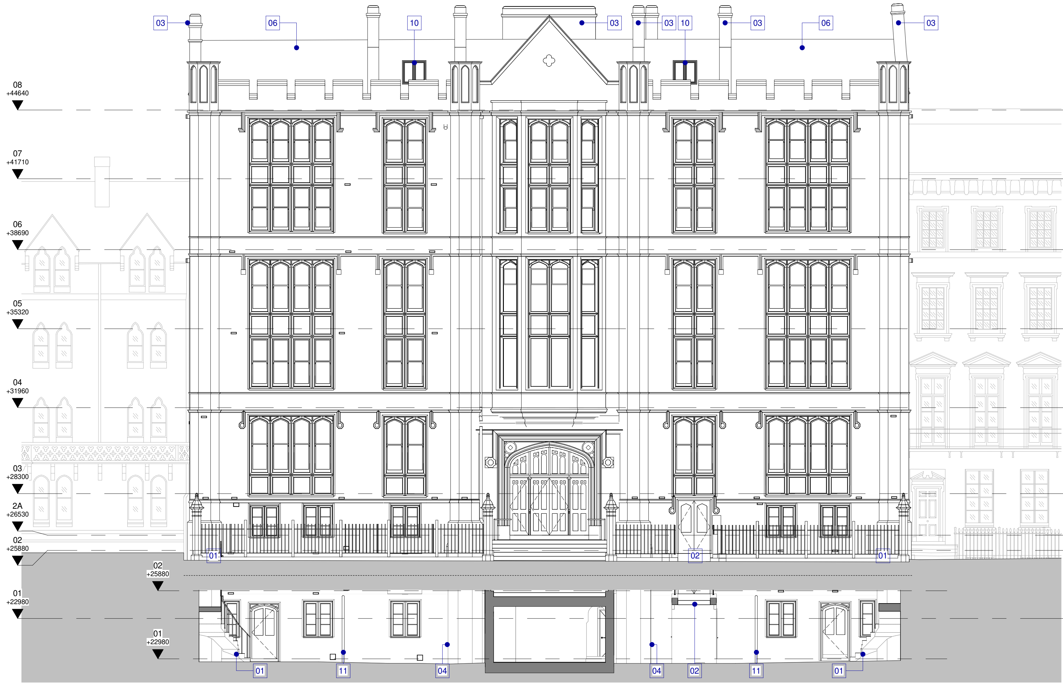
Proposed GA Elevation - Front 1 : 100