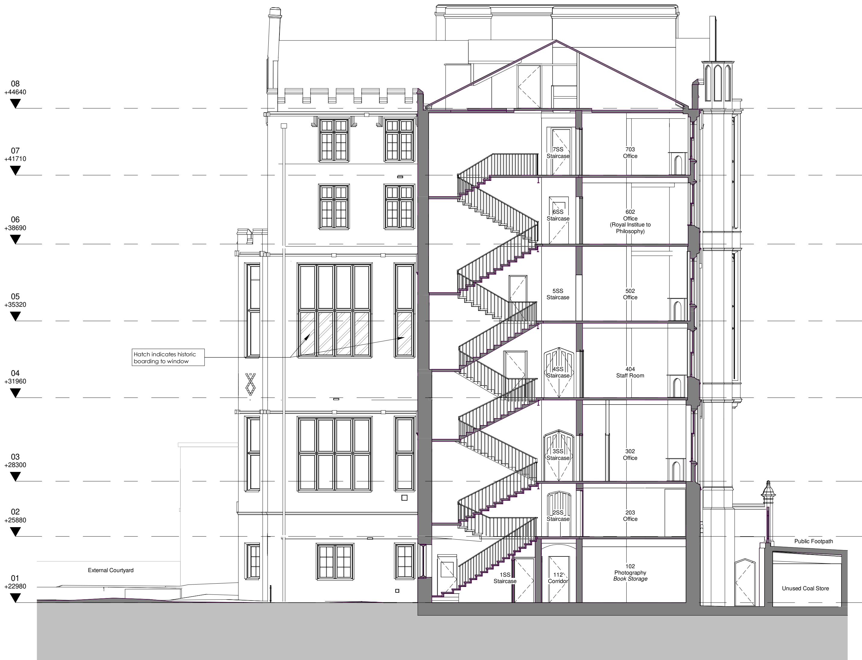
Existing GA Elevation - Central Wing A 1 : 100

Drawing based on survey information, Revit model and CAD drawings produced by City Survey's and Survey Hub, refer to below files. CPMG cannot be held responsible for any discrepancies within the original Revit survey or CAD drawings. - 10410E_R (City Surveys) - CSDr 000765-DWL-SU-DRG-0001-A01.rvt (City Surveys) - 3916_Dr Williams Library_3D Model (Survey Hub)