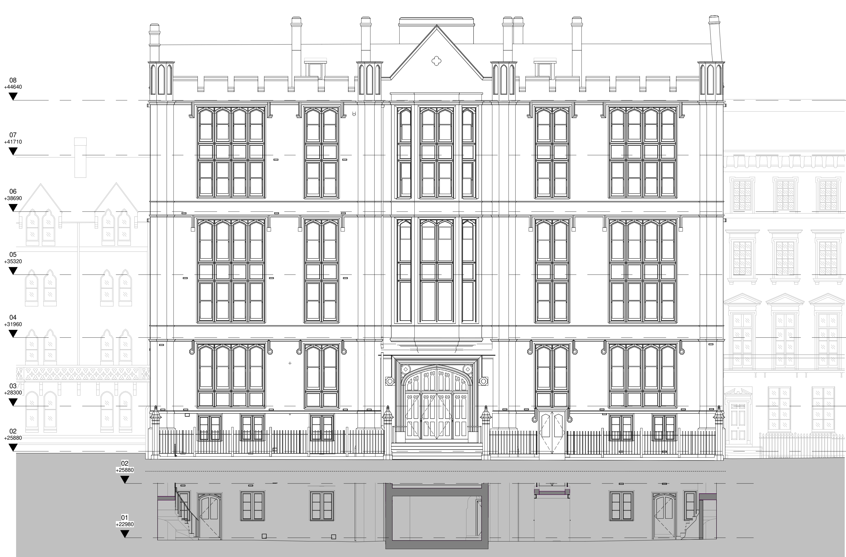
Existing GA Elevation - Front 1 : 100