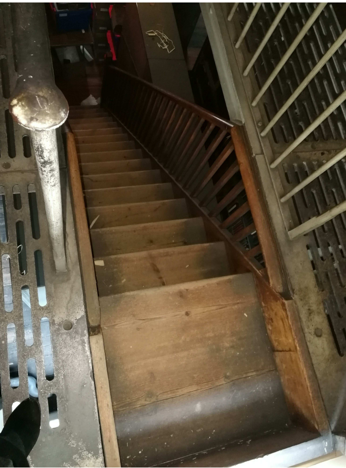
Existing Metal Floor, Timber Access Stair to be removed. Cracks in historic lime plaster to be repaired by plaster specialist in lime.