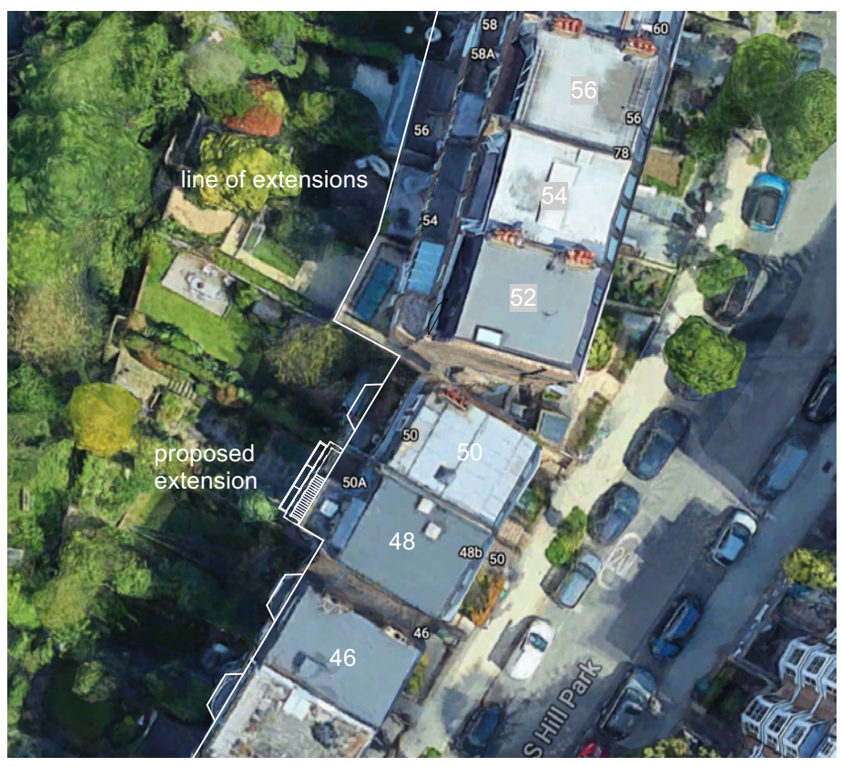
showing proposed extension in relationship with line of extensions to rear of the buildings