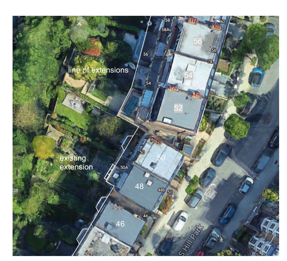
showing existing line of extensions to rear of the buildings