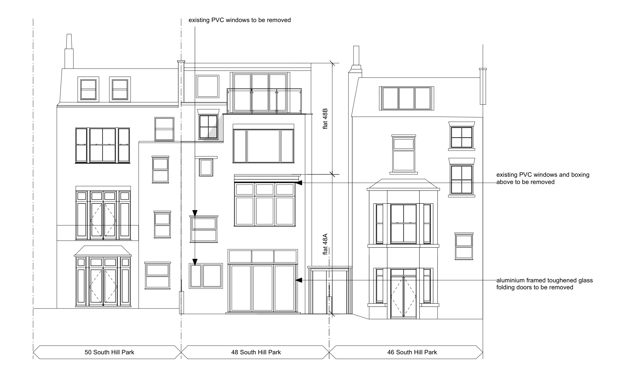
REAR ELEVATION existing