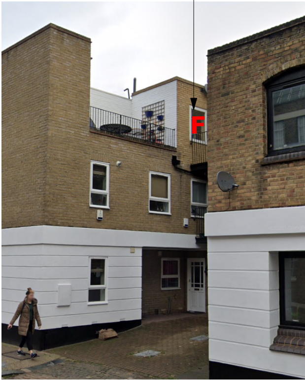
Second Floor window to family room