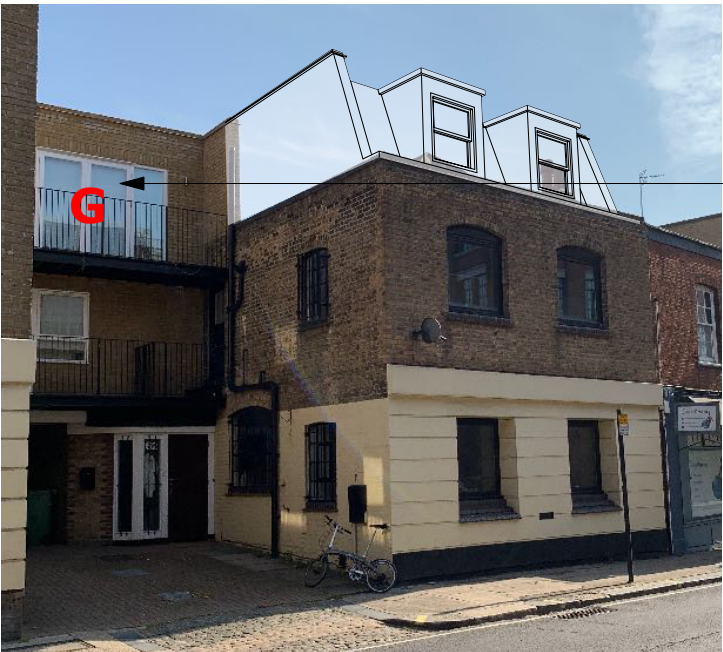
Second Floor window to family room

Existing: 26.5% Proposed: 22.5% Difference: 4.0% As percentage of original: 84.9%