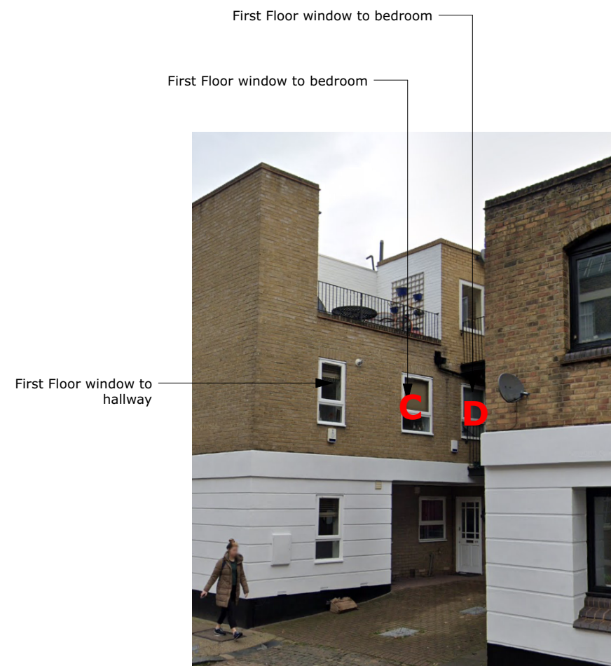
62a Highgate Road - Room layout assumed to match approved plans from application ref. 2004/2612/L