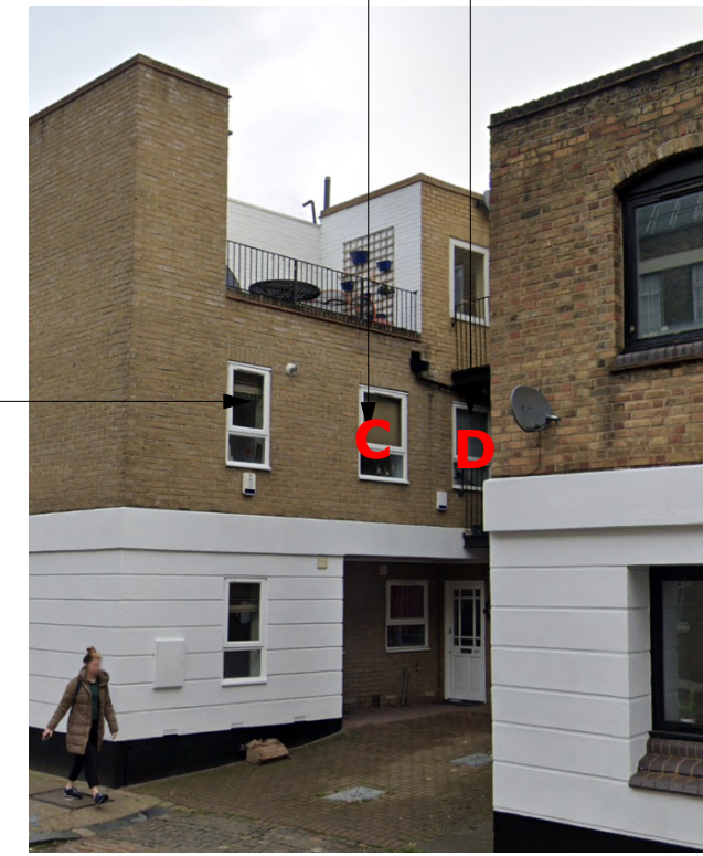
First Floor window to hallway