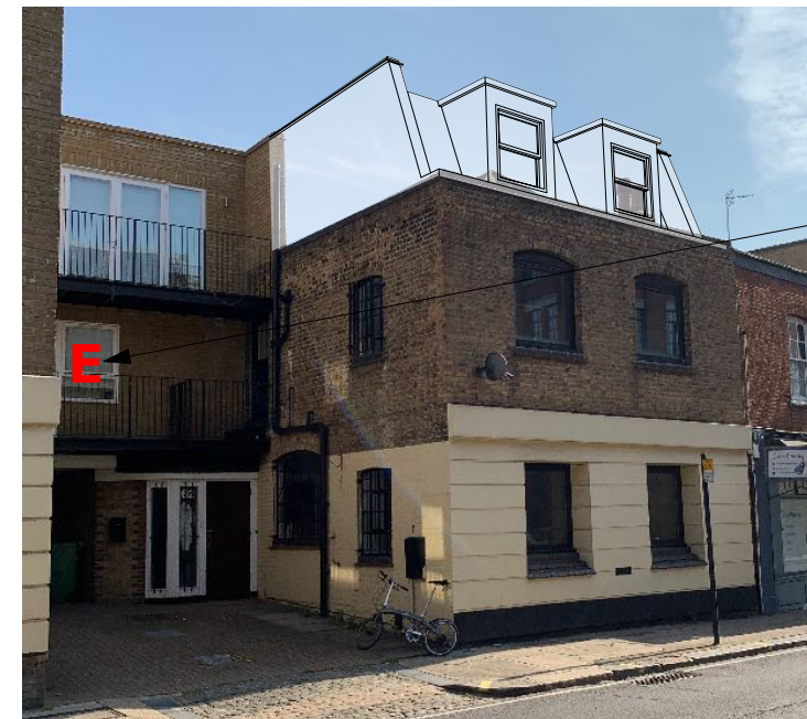
First Floor window to bedroom