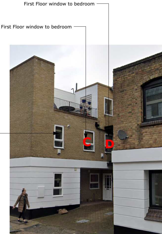
62a Highgate Road - Room layout assumed to match approved plans from application ref. 2004/2612/L