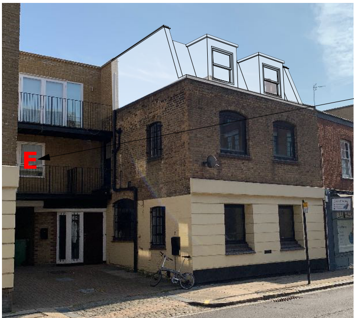
First Floor window to bedroom