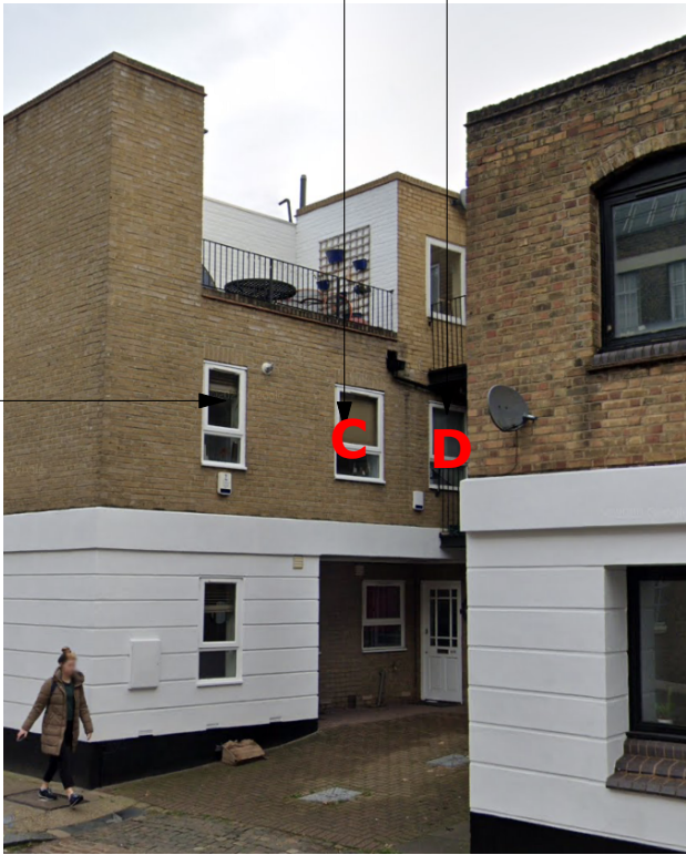
First Floor window to hallway