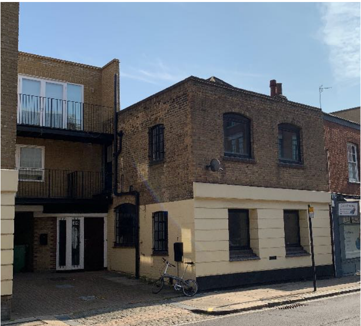
2 Existing Courtyard Space Proposed ghosted on