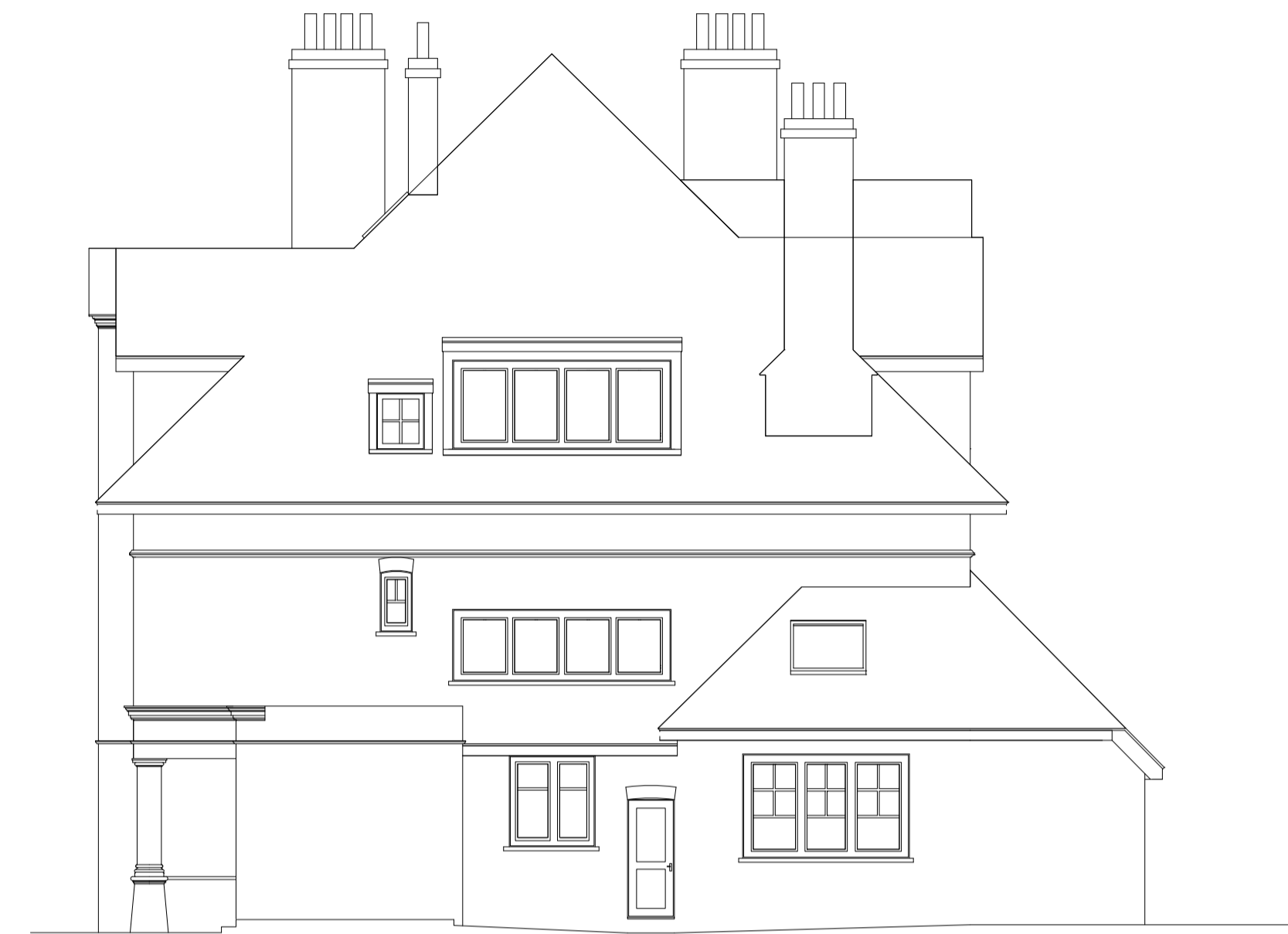
Existing East elevation