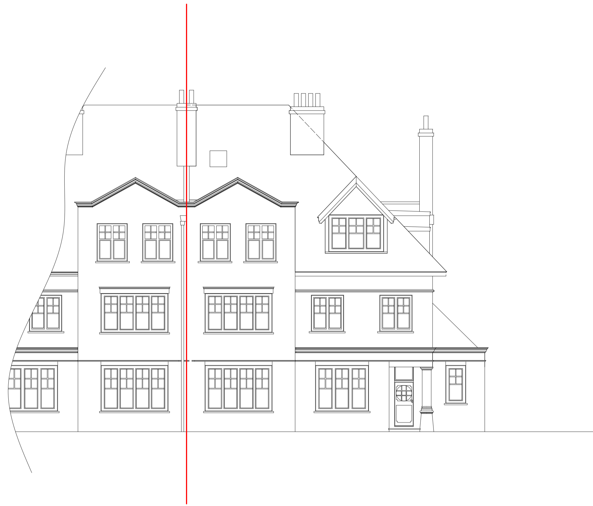
Existing South elevation

In the event of any detail or dimensional conflict between Charlton Brown Architects drawings, the matter must be referred back to Charlton Brown Architects for clarification