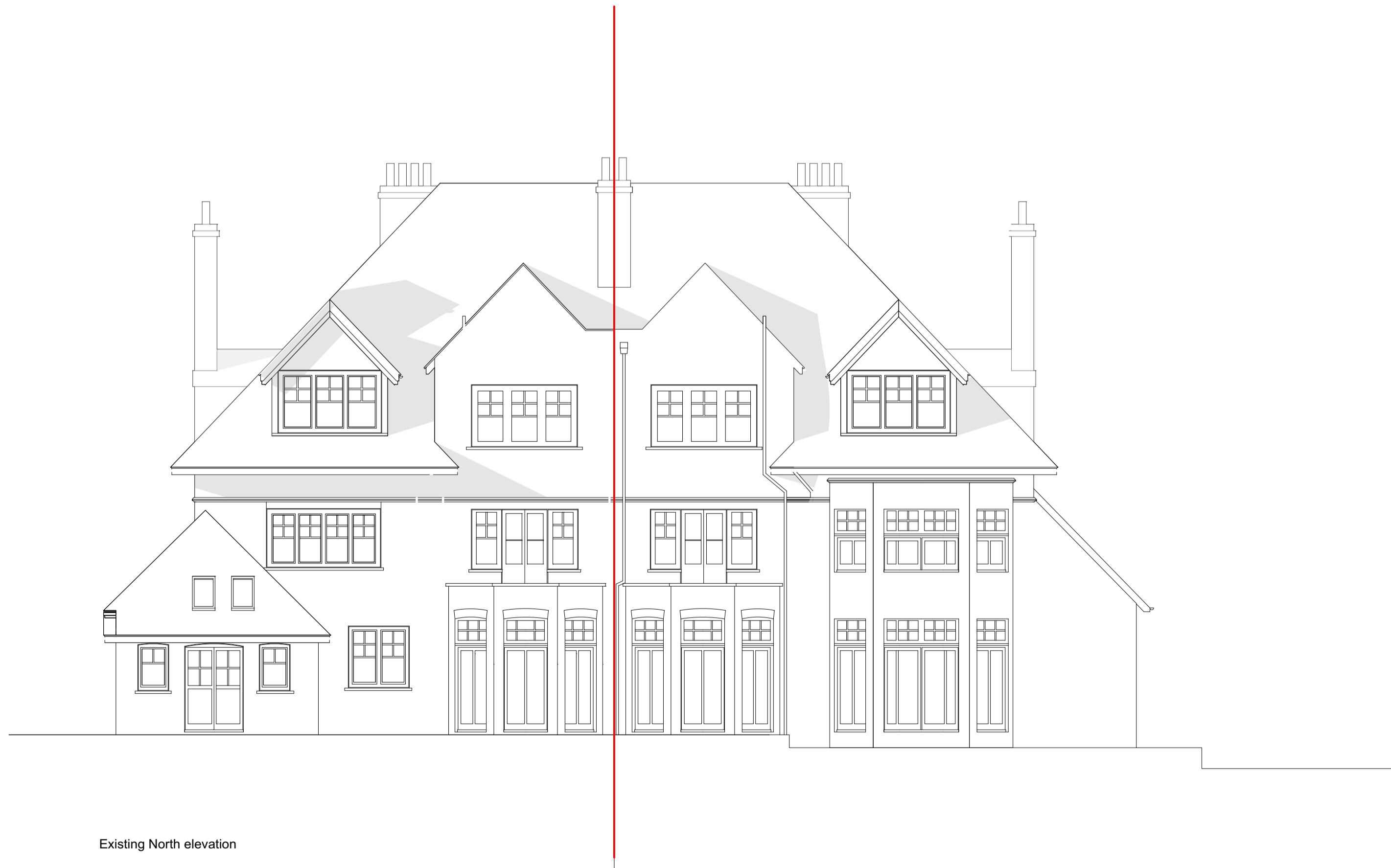
Existing North elevation