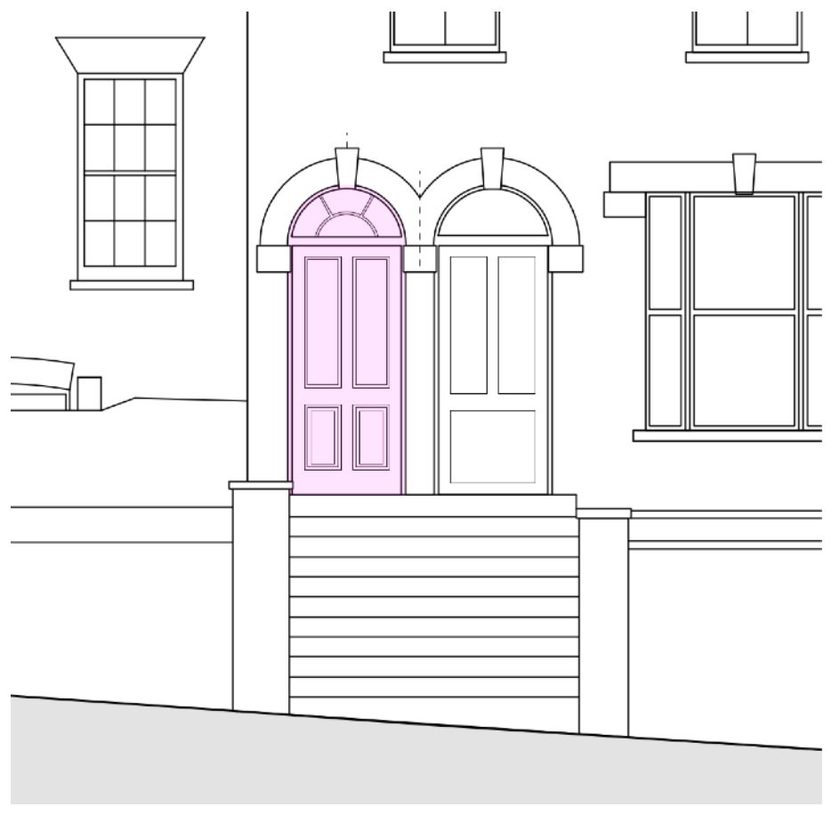
View of proposed door with glazed fanlight over