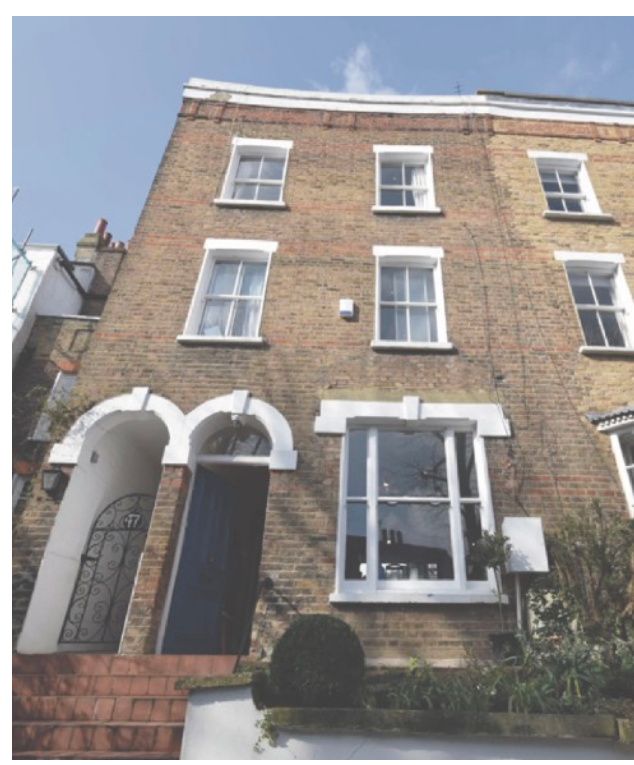
Views of steps from pavement leading to entrances of 47 & 49 Flask Walk (2019)