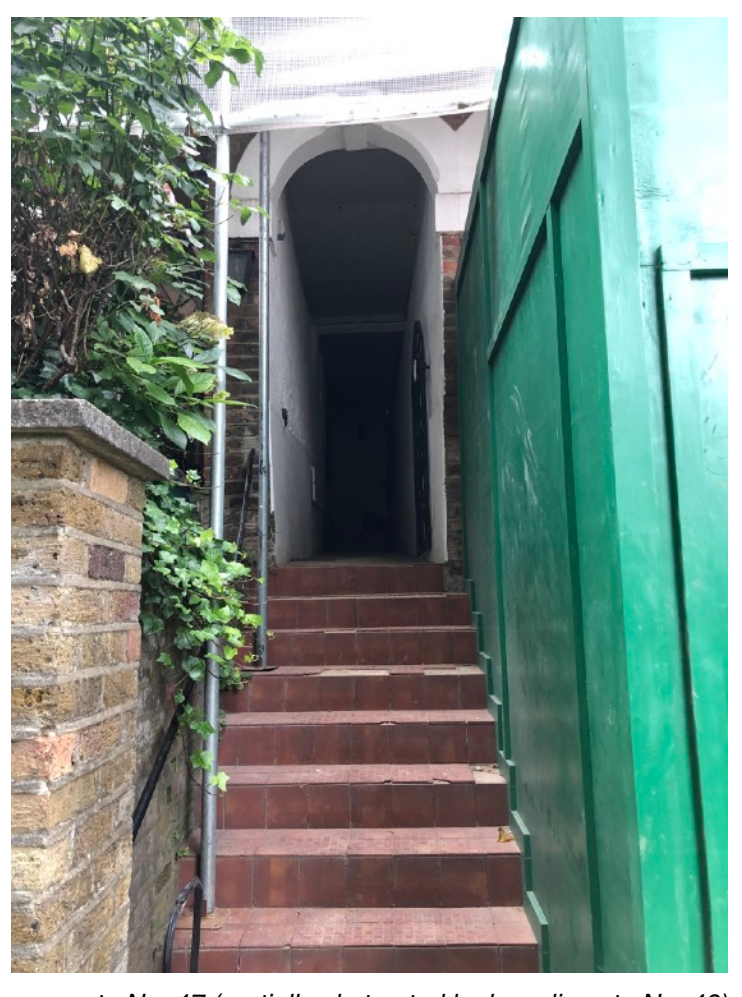
Recent view of dark narrow passageway to No. 47 (partially obstructed by hoardings to No. 49)