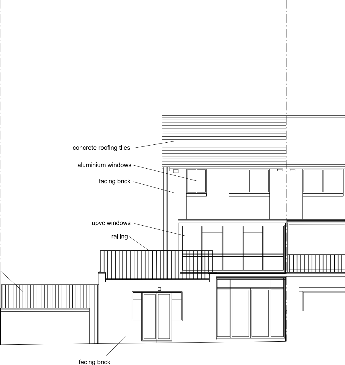
Datum: 35.00m. Back Elevation Existing Rear Elevation