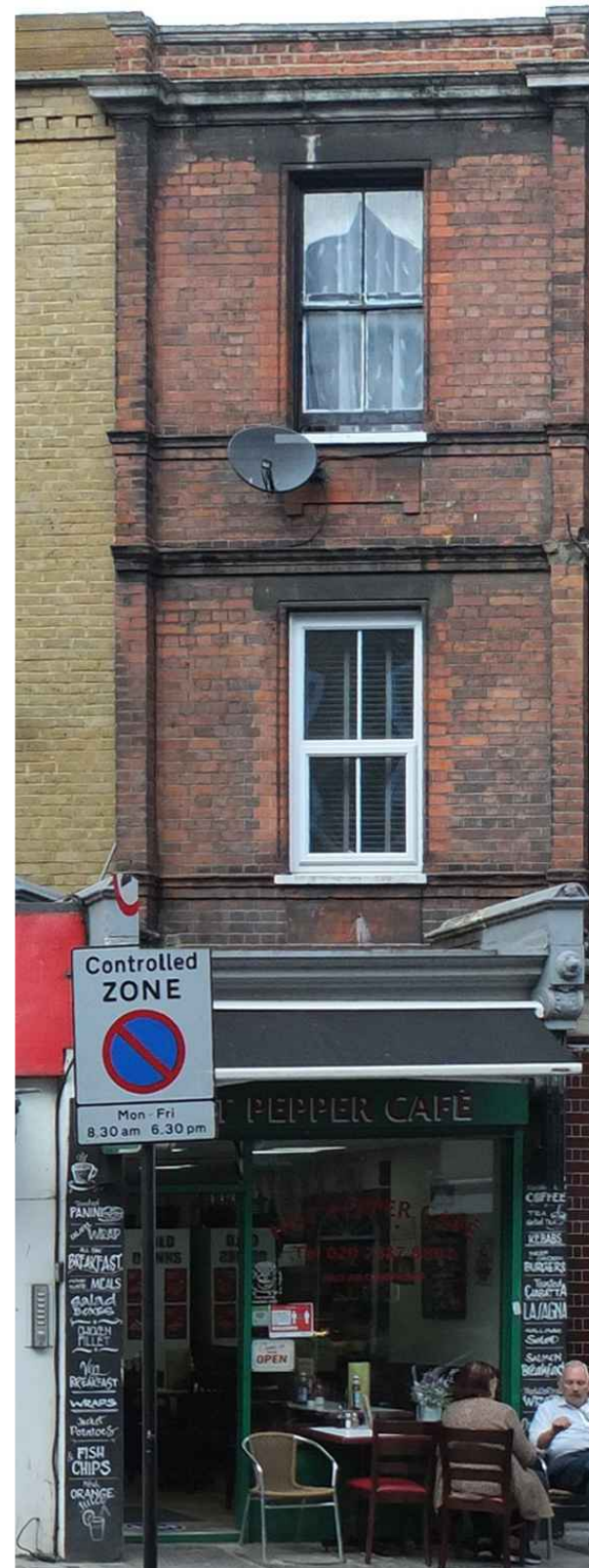
02 Existing Photo Elevation