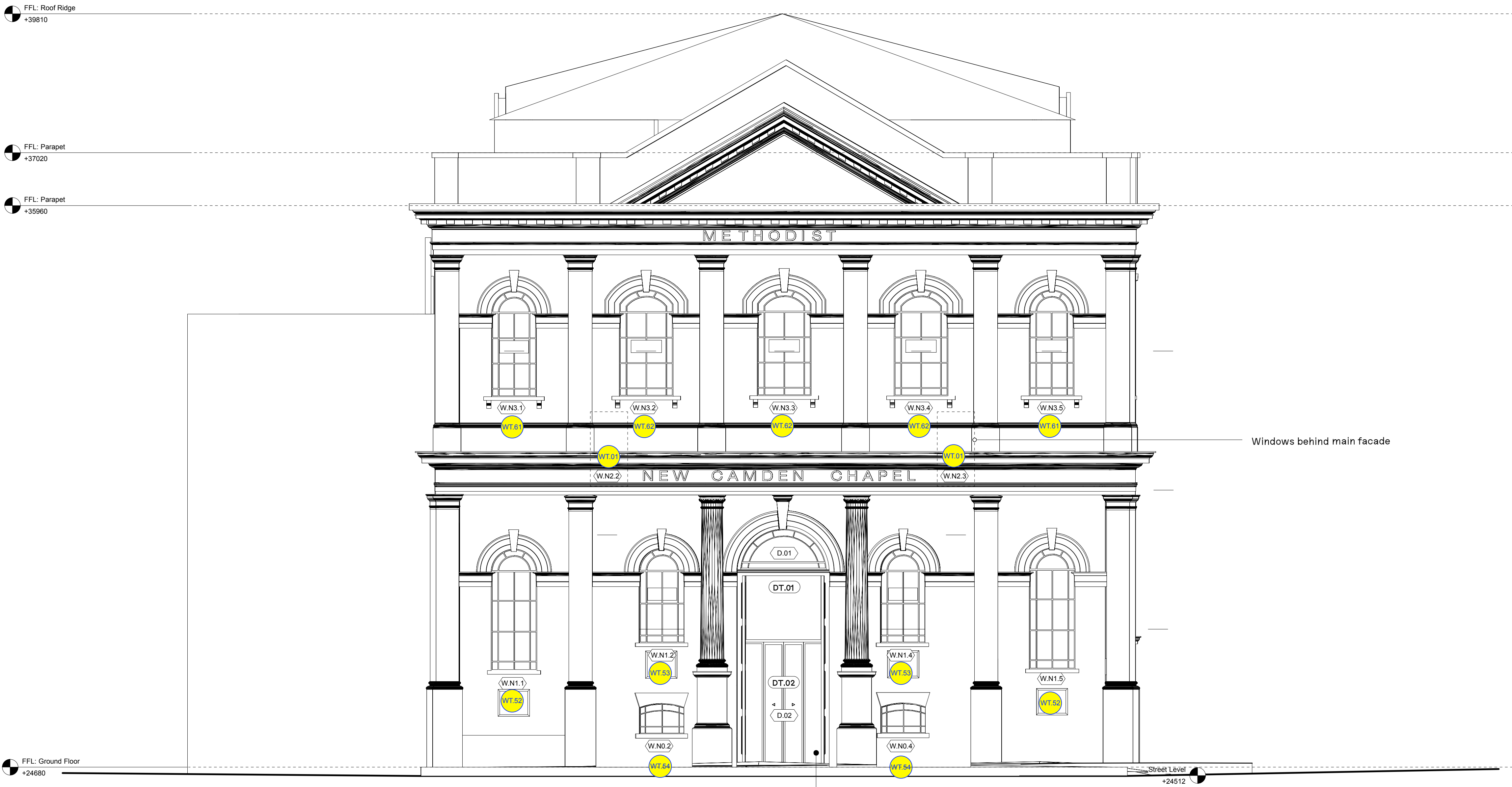
1 Proposed Front (North) Elevation Scale: 1:50