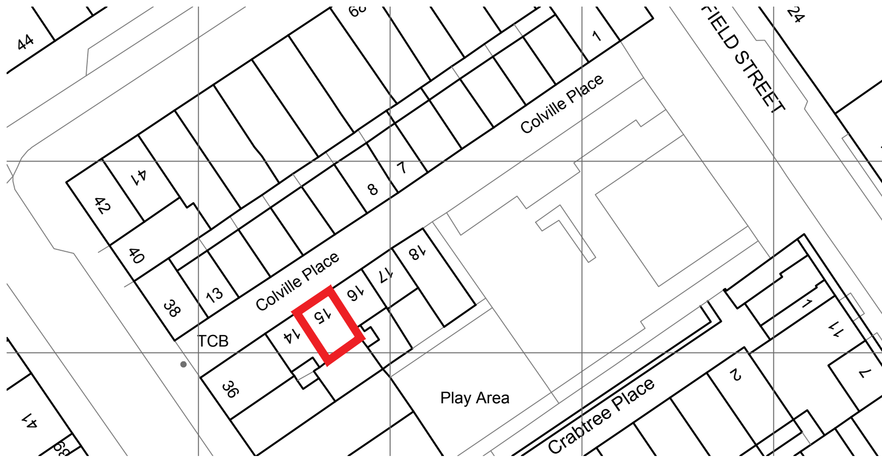
2 EXISTING BLOCK PLAN Scale: 1:500