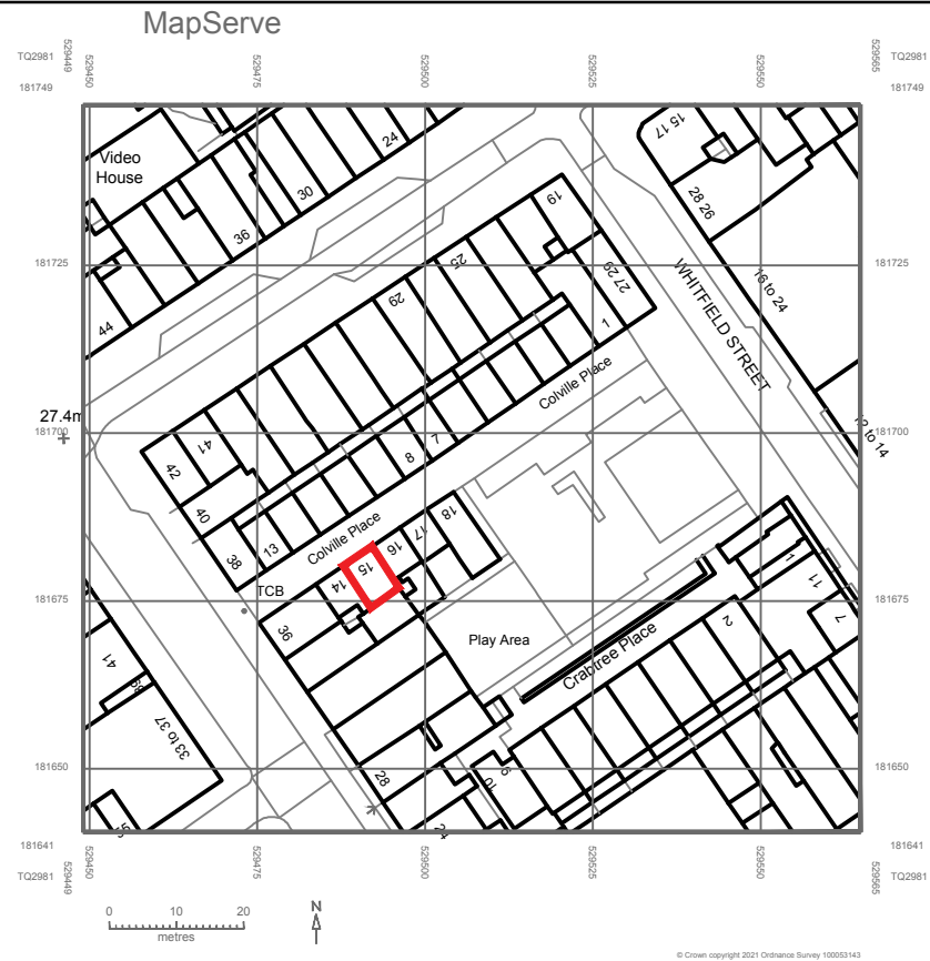
1 EXISTING SITE PLAN Scale: 1:1250