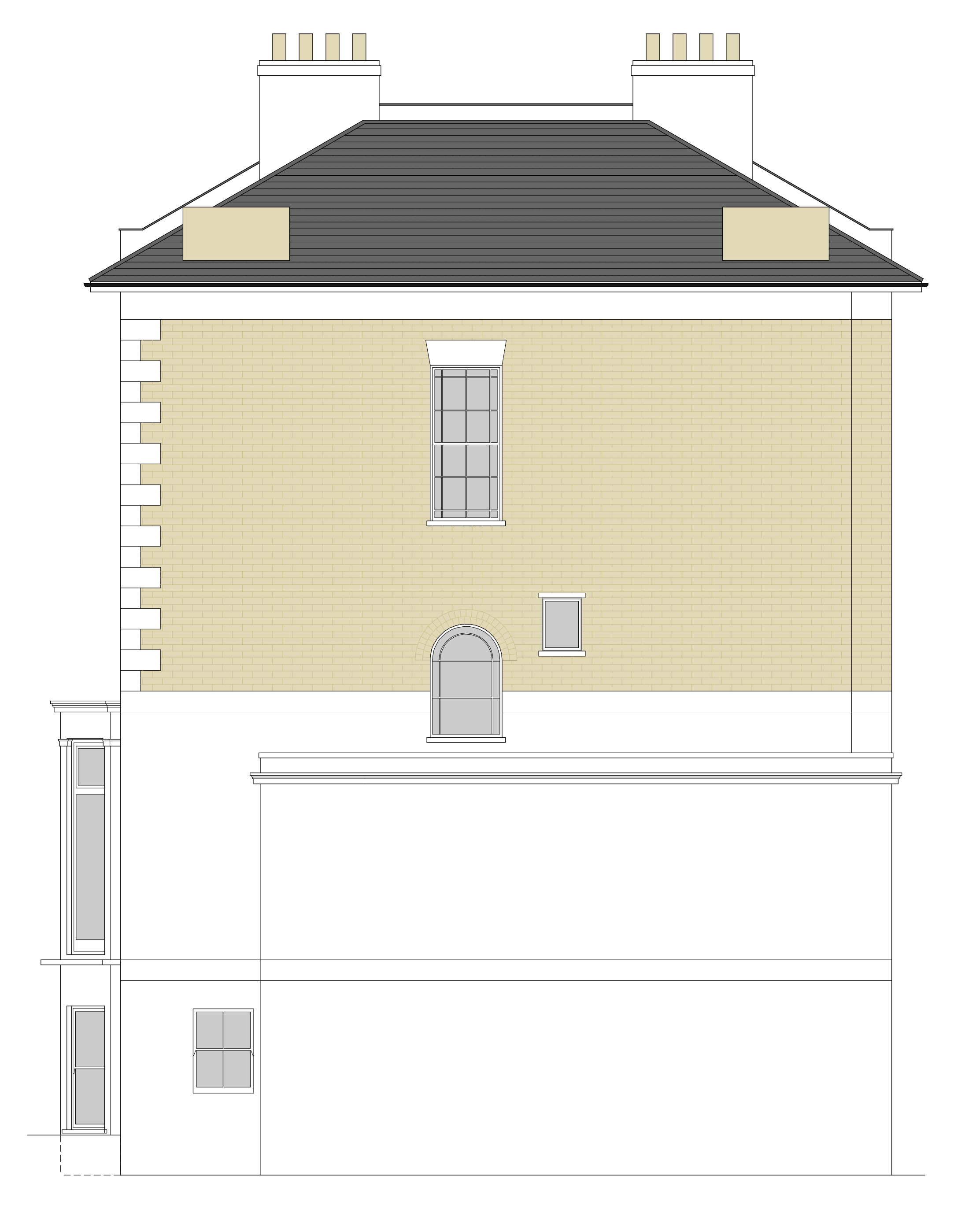
Existing flank elevation