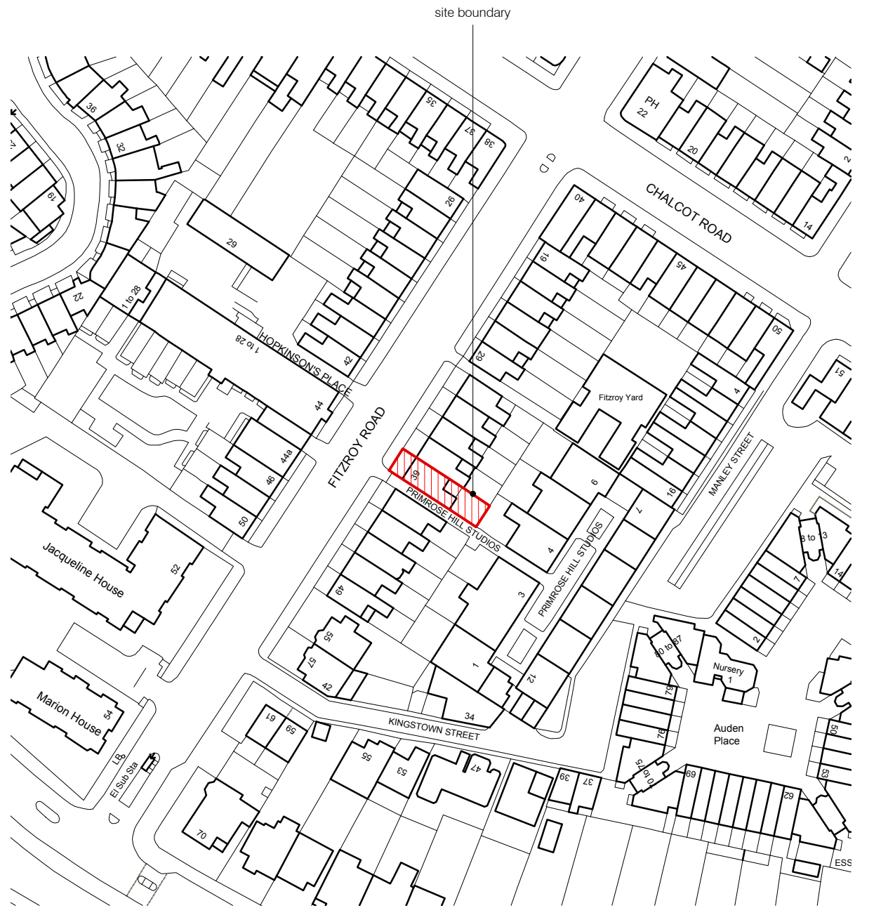
01 LOCATION PLAN scale 1:1250