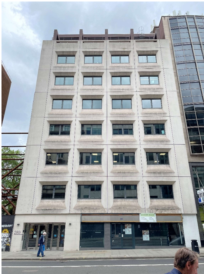
Photograph of the street elevation of 289 High Holborn

The existing building as can be seen above is brutalist in architectural style and the windows on the upper floors are aluminium in a grey-brown colour. The proposed entrance door will be much more in keeping with the style of the existing building and tie in with the existing fenestration.