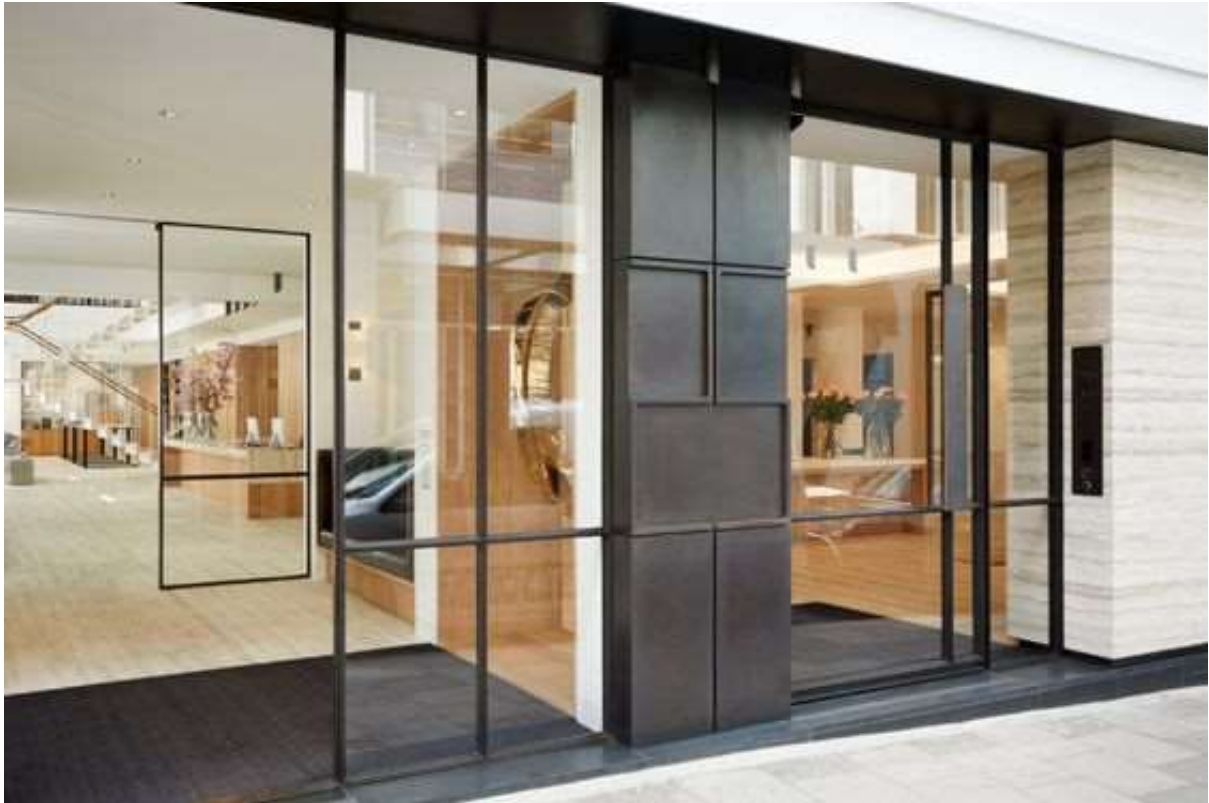
Precedent for entrance doors – 25 Savile Row