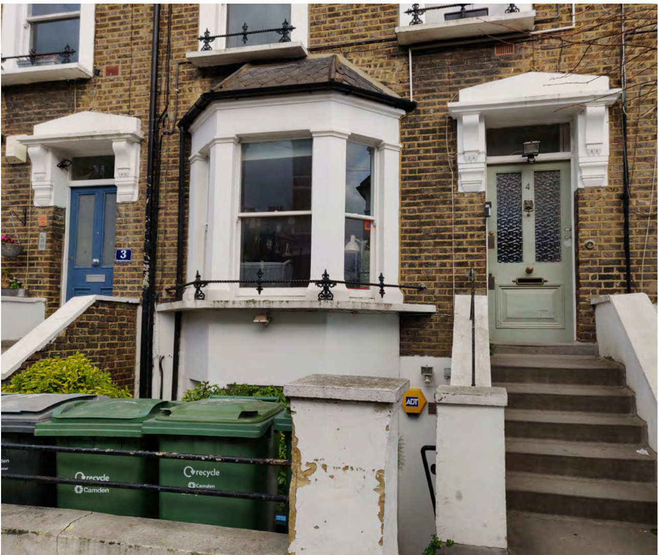
[Fig.01] View of Existing Ground Floor Bay Window - To Centre-Left of Image

Project: Extension & Alterations at 4 Montpelier Grove Reference: 2108_R005 Date: 25/08/2021 Applicants: Mr Masayoshi Noro & Miss Heloise Ingrand 4 Montpelier Grove Camden London NW5 2XD Agent: Neil Kahawatte Architects Unit 310 4 Fortess Road London NW5 2ES