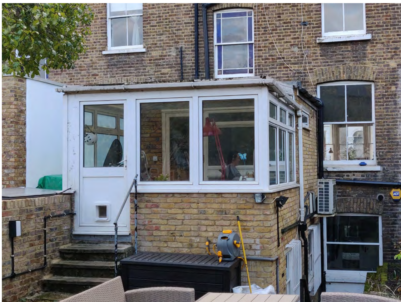
[Fig 0.3 ] View of Existing Rear Building Projection