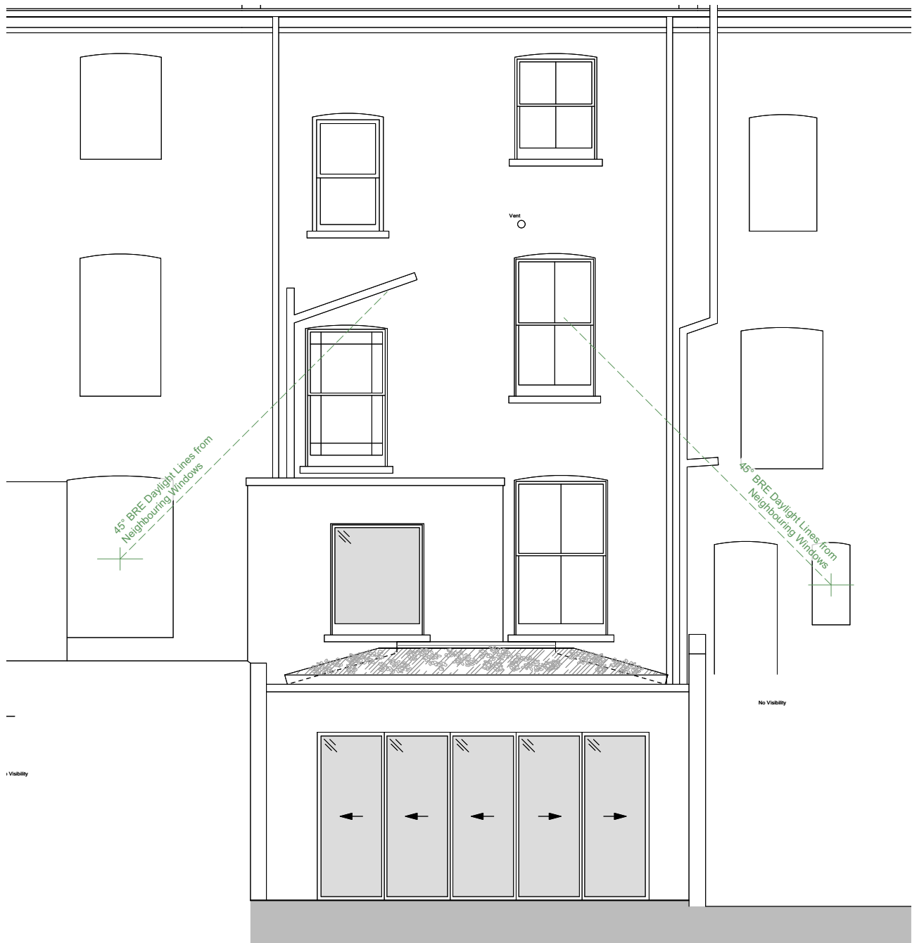
[Fig 0.4] Proposed Rear Elevation & Daylight to Neighbouring Property

As per the BRE Guide (Site layout planning for daylight and sunlight), the extension does not lie within the 45 degree angle of any neighbouring windows/ patio doors in either plan, nor elevation and so will not have a negative impact on lighting levels for surrounding properties.