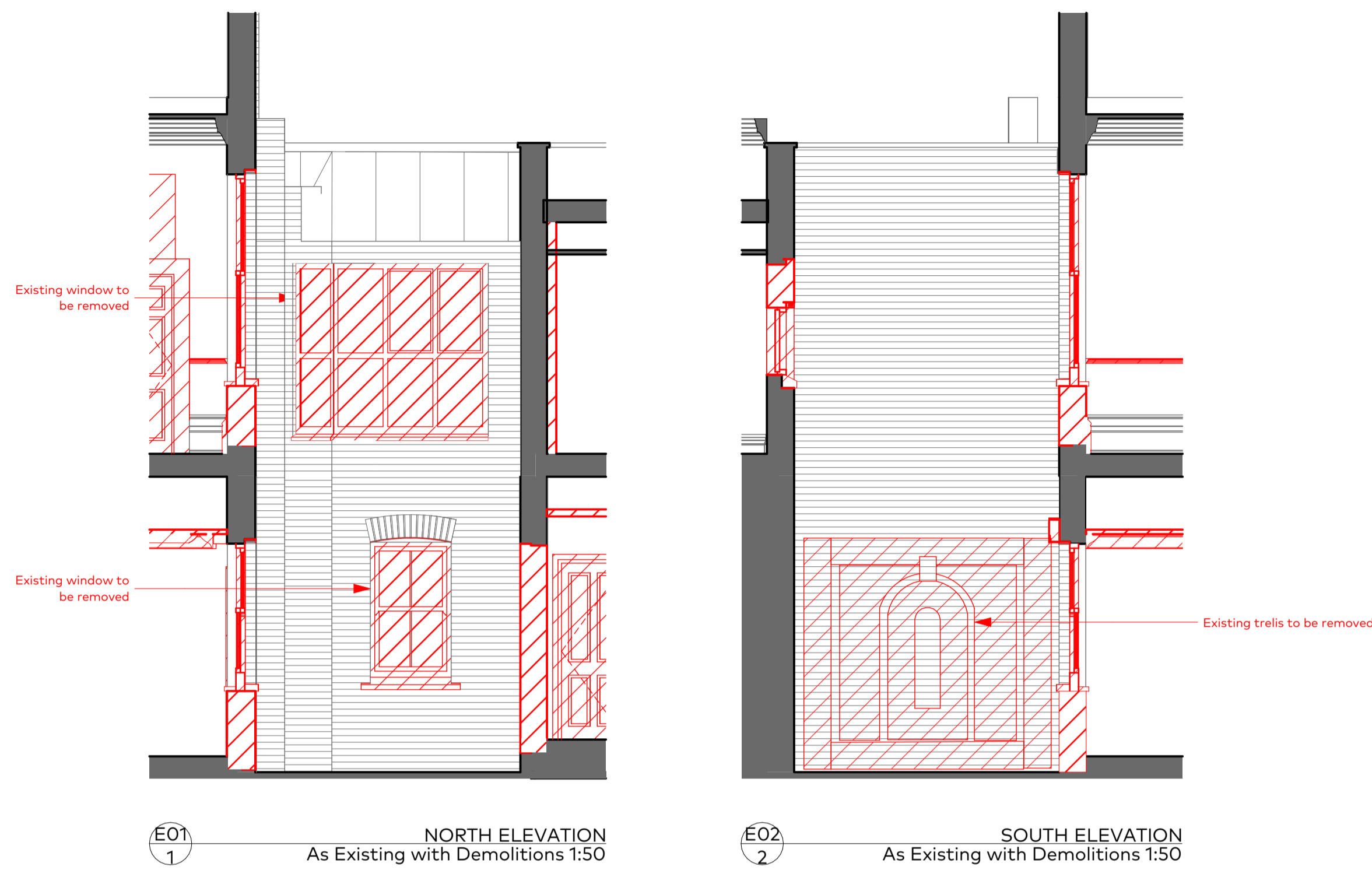
E01 1 NORTH ELEVATION As Existing with Demolitions 1:50

Information contained on this drawing is the sole copyright of Garnett & Partners and is not to be reproduced without their permission