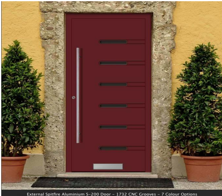
External Spitfire Aluminium S-200 Door - 1732 CNC Grooves - 7 Colour Options