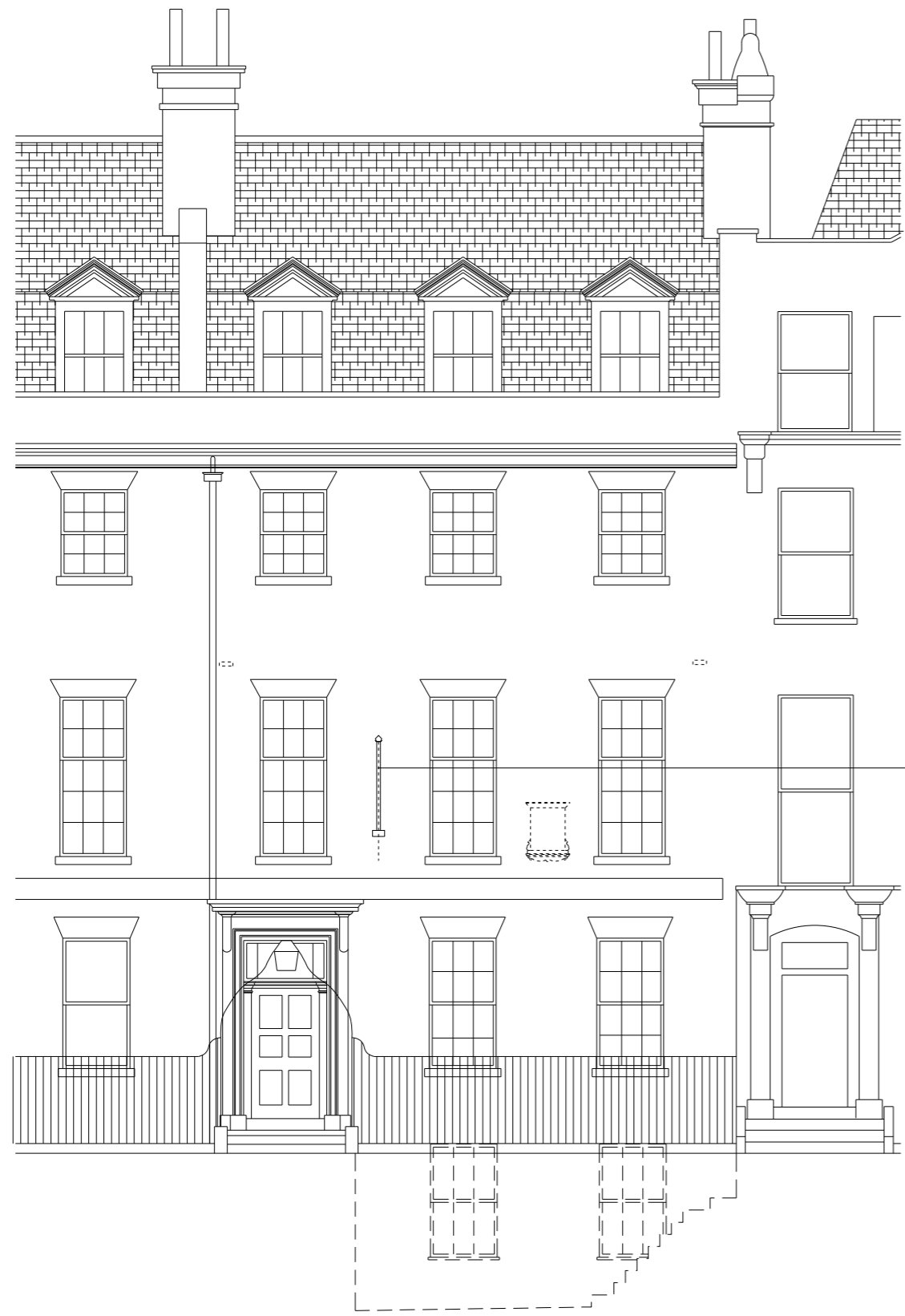
01 FRONT ELEVATION (NORTH EAST)

ALL RIGHTS RESERVED. THIS WORK IS COPYRIGHT AND CANNOT BE REPRODUCED OR COPIED OR MODIFIED IN ANY FORM OR BY ANY MEANS, GRAPHIC ELECTRONIC OR MECHANICAL, INCLUDING PHOTOCOPYING WITHOUT THE WRITTEN PERMISSION OF DAO ESTATE LTD.