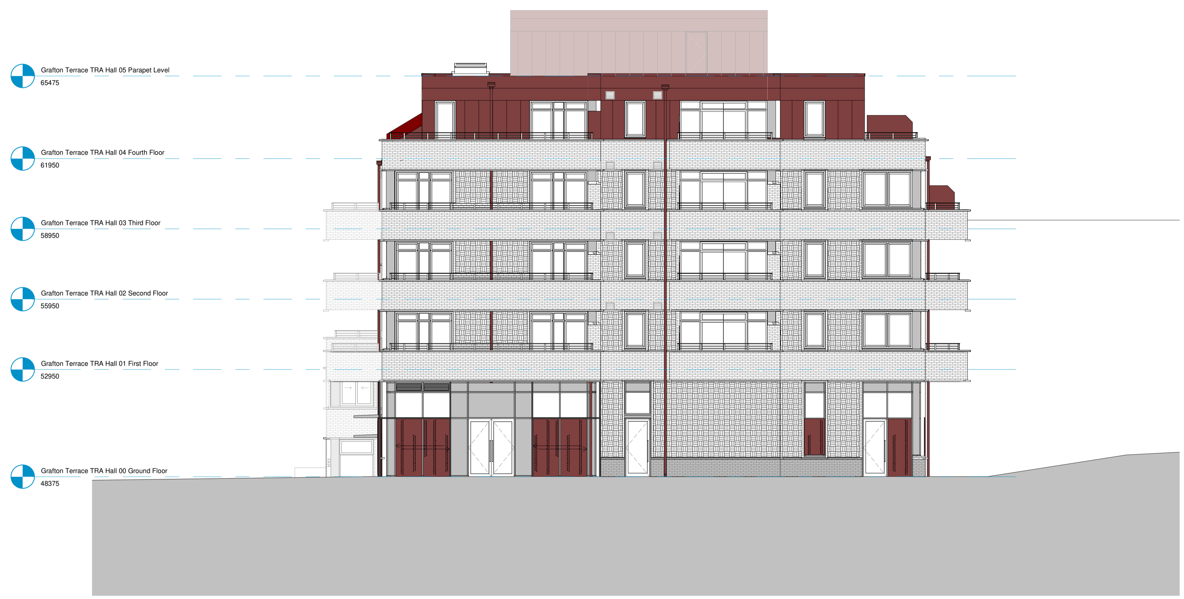
1 West Elevation - Clean 1 : 100