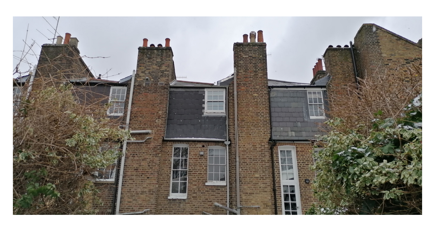
Photo 11. Rear elevation showing non-orginal 2nd floor sash window within slates. We aim to reinstate the original proportions of this window as still extant on the two adjacent houses.