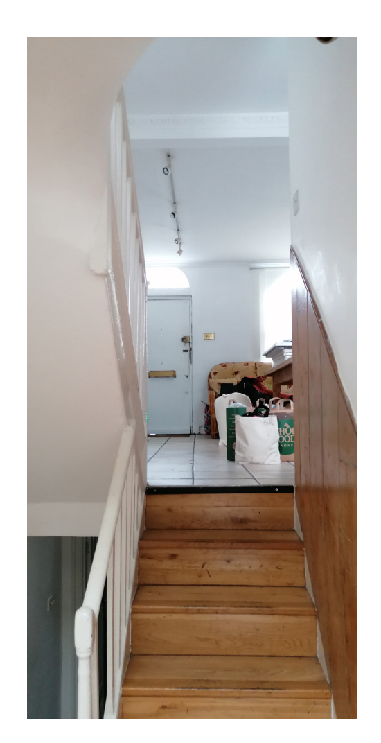
Photo 7. View looking towards the front door from the existing basement. We are seeking to reinstate the entrance hall enclosure to restore part of the historic plan form.