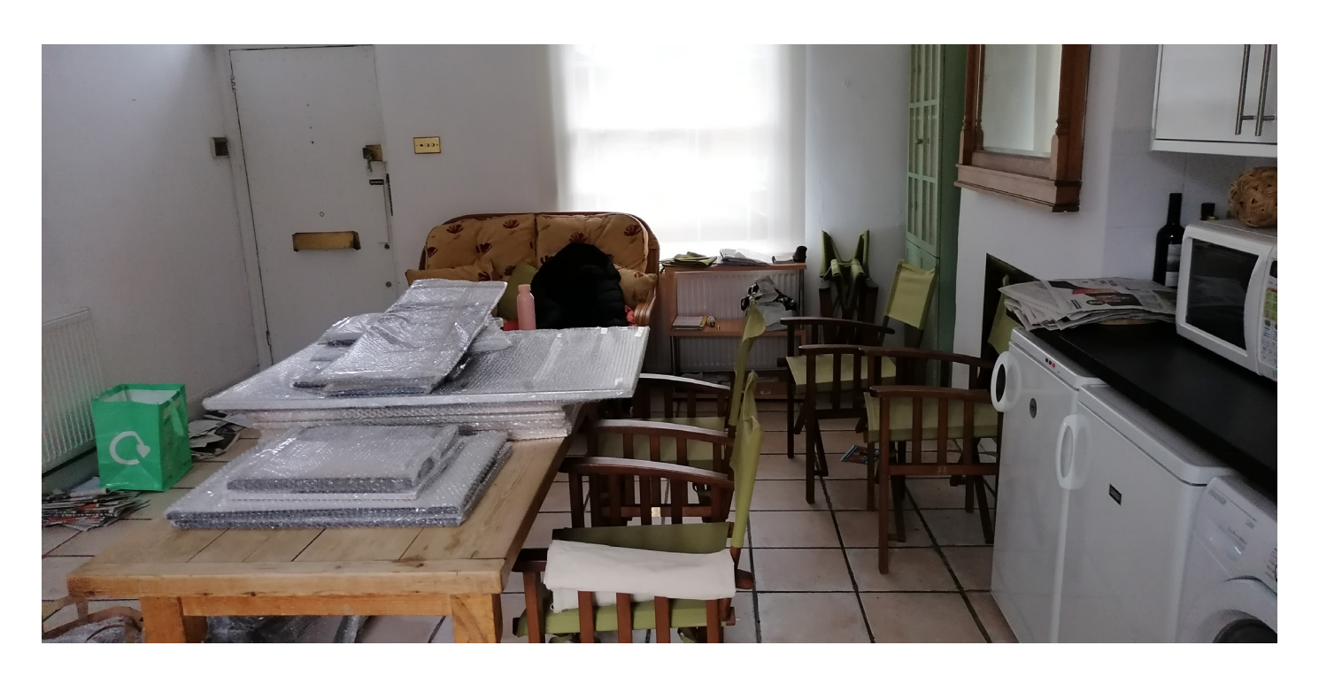
Photo 10. Ground floor front room. A period correct fireplace will be installed on the RHS. On the LHS, the internal wall will be rebuilt.