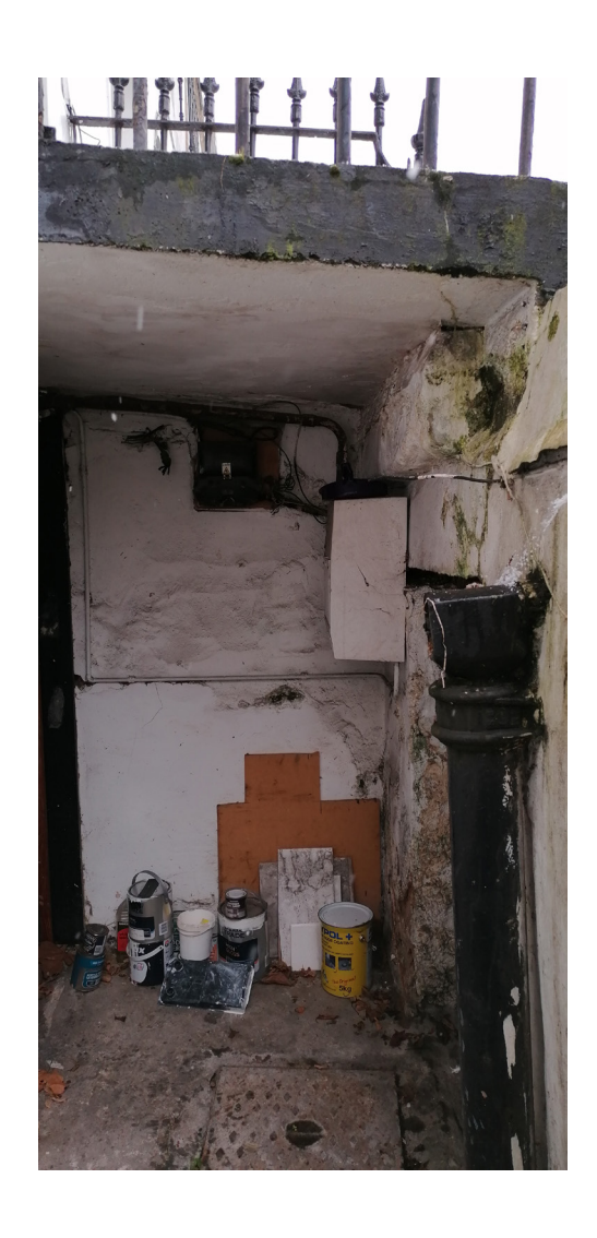
Photo 4. The proposed hardwood external door will be located in line with the entrance step above