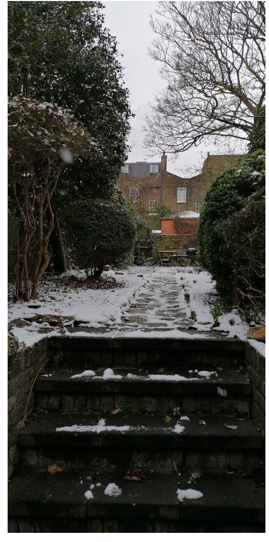
Photo 13. Looking down the garden away from the house towards the site of the proposed garden room.