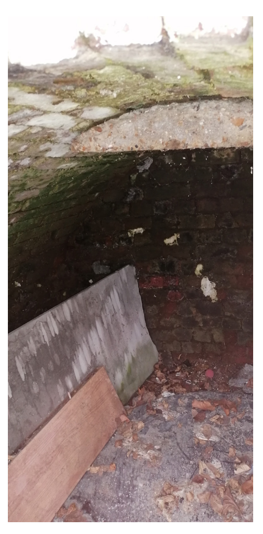
Photo 3. Detail of one of the existing vaults. The brick arch will be preserved with the installation of a reversable drained cavity membrane system.