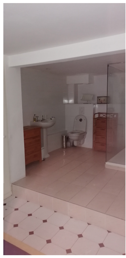
Photo 5. The basement spine all and rear room internal door will be restored to the historic plan form