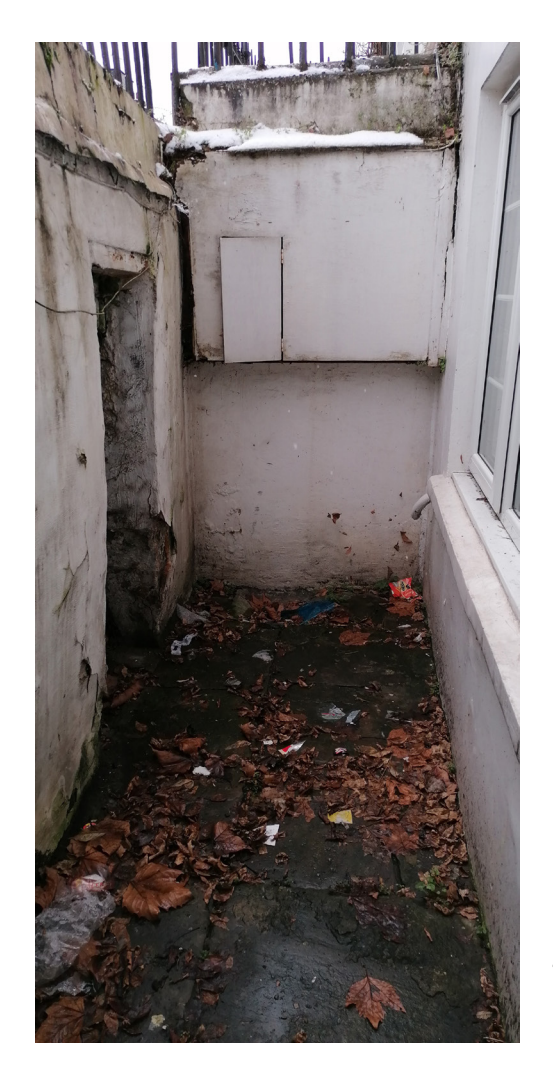
Photo 2. Existing front lightwell with one of the two doorways to the vaults visible on the LHS