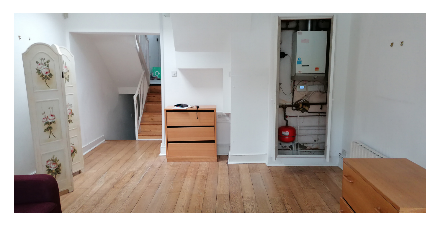
Photo 8. Looking towards the rear of the original house from the existing extension. The non-original opening is visible on the LHS. This will be retained