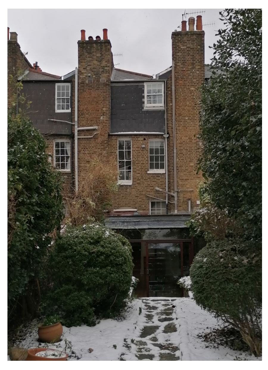
Photo 12. Rear elevation showing existing rear extension and obscured ground floor rear window.