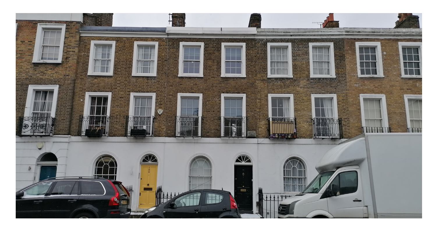
Photo 1. Front elevation of 111 Arlington Road within the street context (centre house with black front door

Photographs forming part of the listed building application