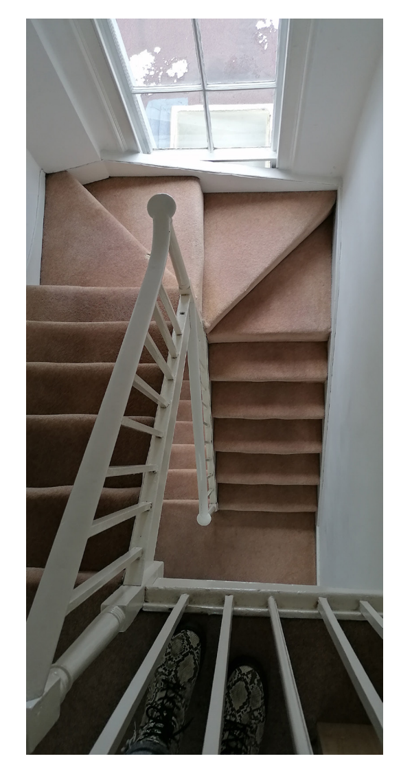
Photo 9. Looking down the staircase from the 2nd floor landing. The original handrail and balusters remain insitu.