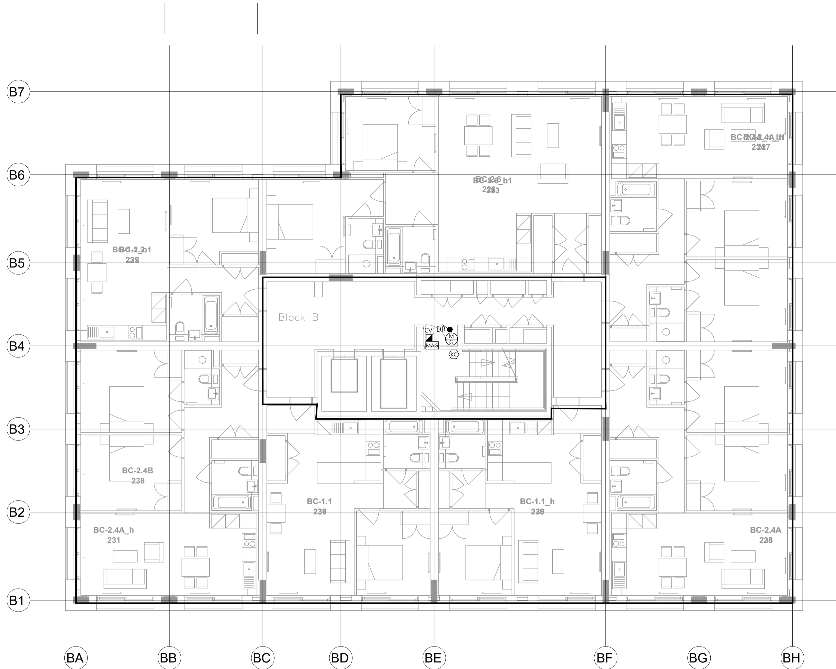
BLOCK B - LEVEL 02