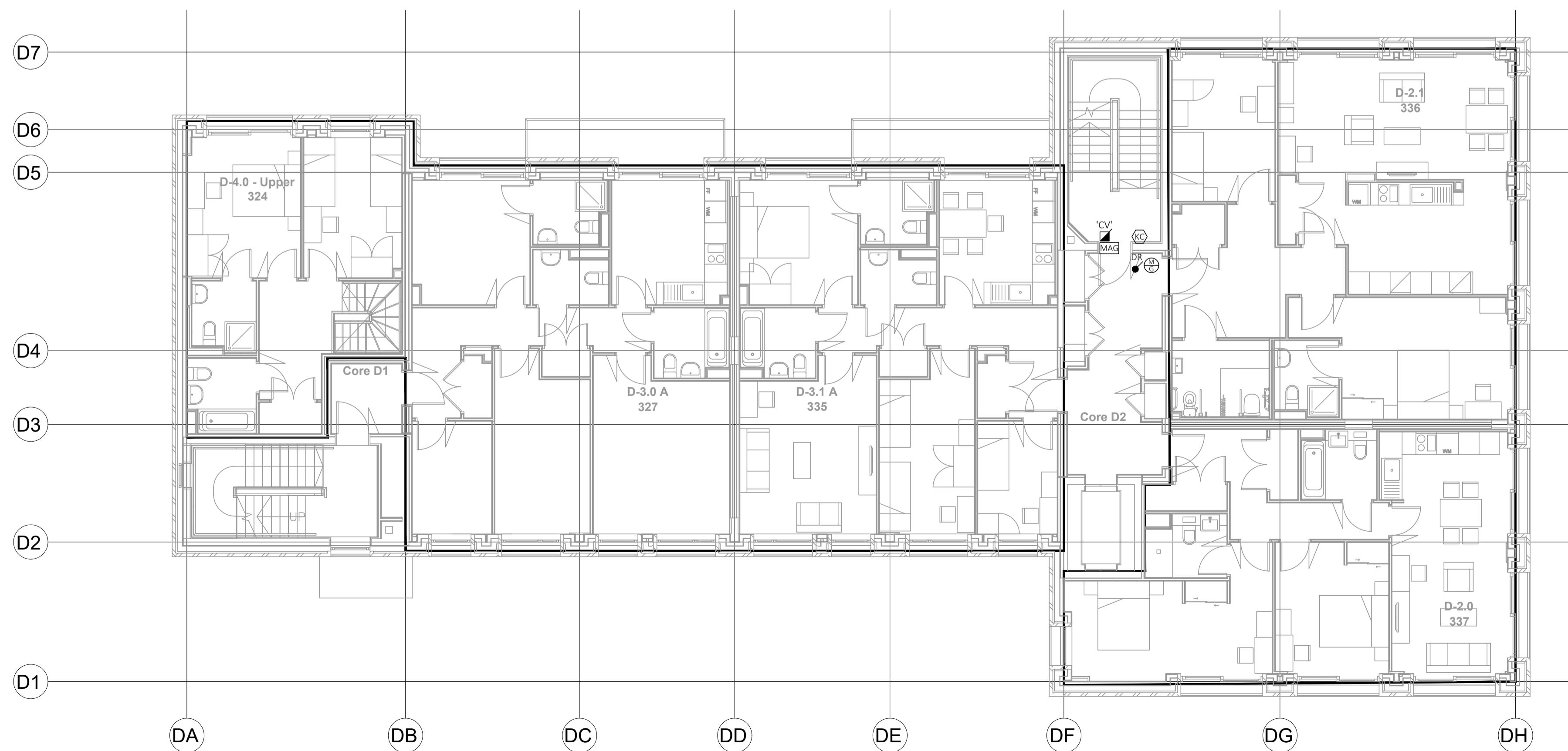
BLOCK D - LEVEL 02