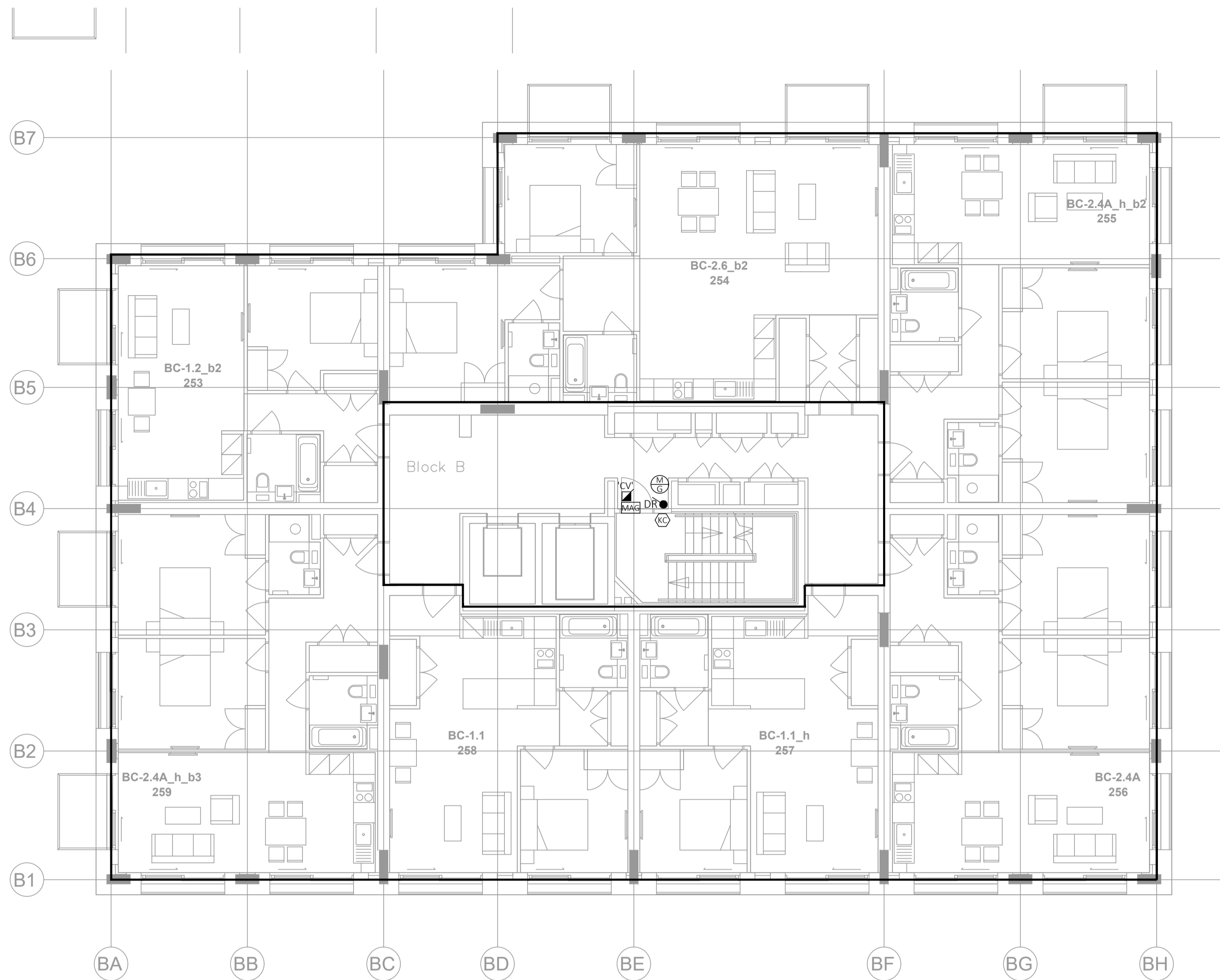
BLOCK B - LEVEL 06