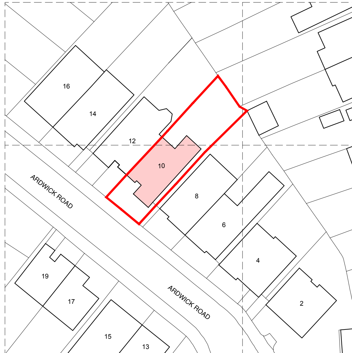
1:500 SITE BLOCK PLAN

Please Note: Original planning drawings prepared by S T S Structural Engineering LTD.