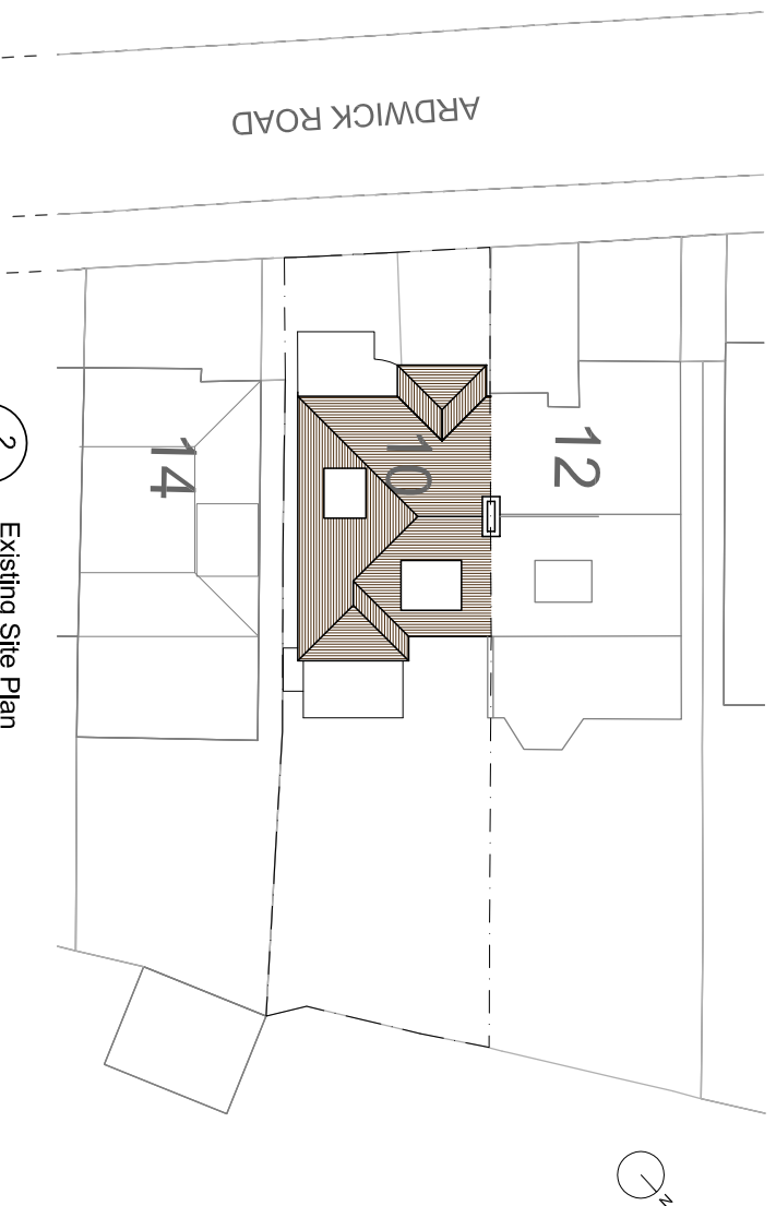
2 Existing Site Plan 001 SCALE 1:250 @ A3