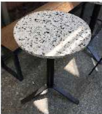
Tables: 550mm Ø tables with black metal pedestal and Terrazo top. 2no. in total