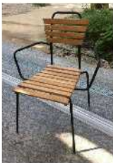
Chairs: 'Harbour' Chairs. Timber seat and back rest with black powder coated frames. 2no. in total