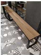
Bench Seats: Timber bench seats @ 1300x358mm (WxD) with black powder coated metal frame. 2no. in total