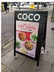
A-Board: 700x660x1190mm (DxWxH). Black metal frame with replaceable graphic panel. Position as shown on plan. 1no. in total

NOTE: All external furniture is free standing and stored within shop during non trading hours