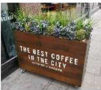
Planters: Cedar planter box with castors and replica planting. 300mm deep and 1000mm high overall, width as noted on plan. 2no. planter boxes in total