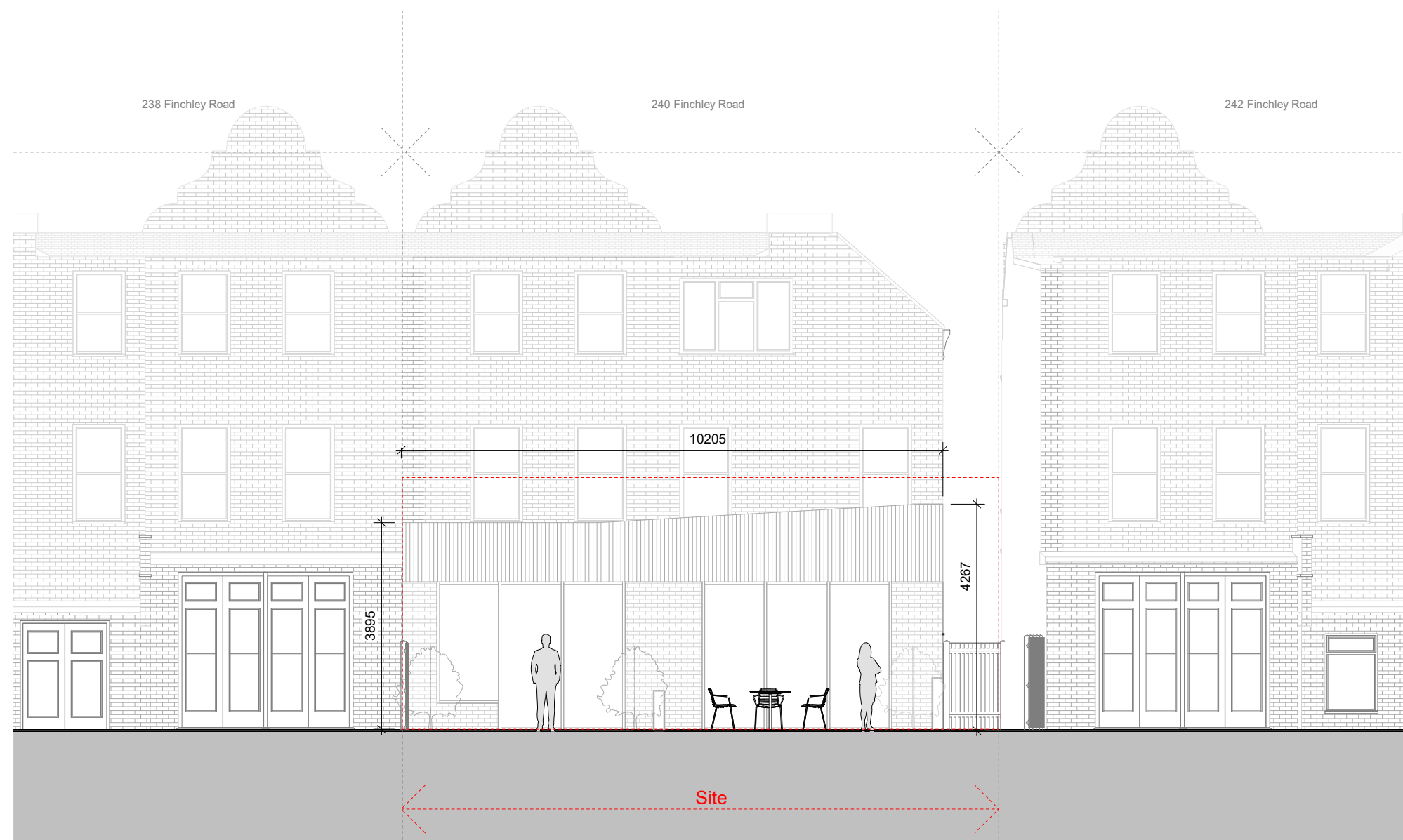
1 Rear Elevation - Proposed 1 : 100

(c) - Kristofer Adelaide Architecture. Registered Company based in England and Wales (No.10782421)