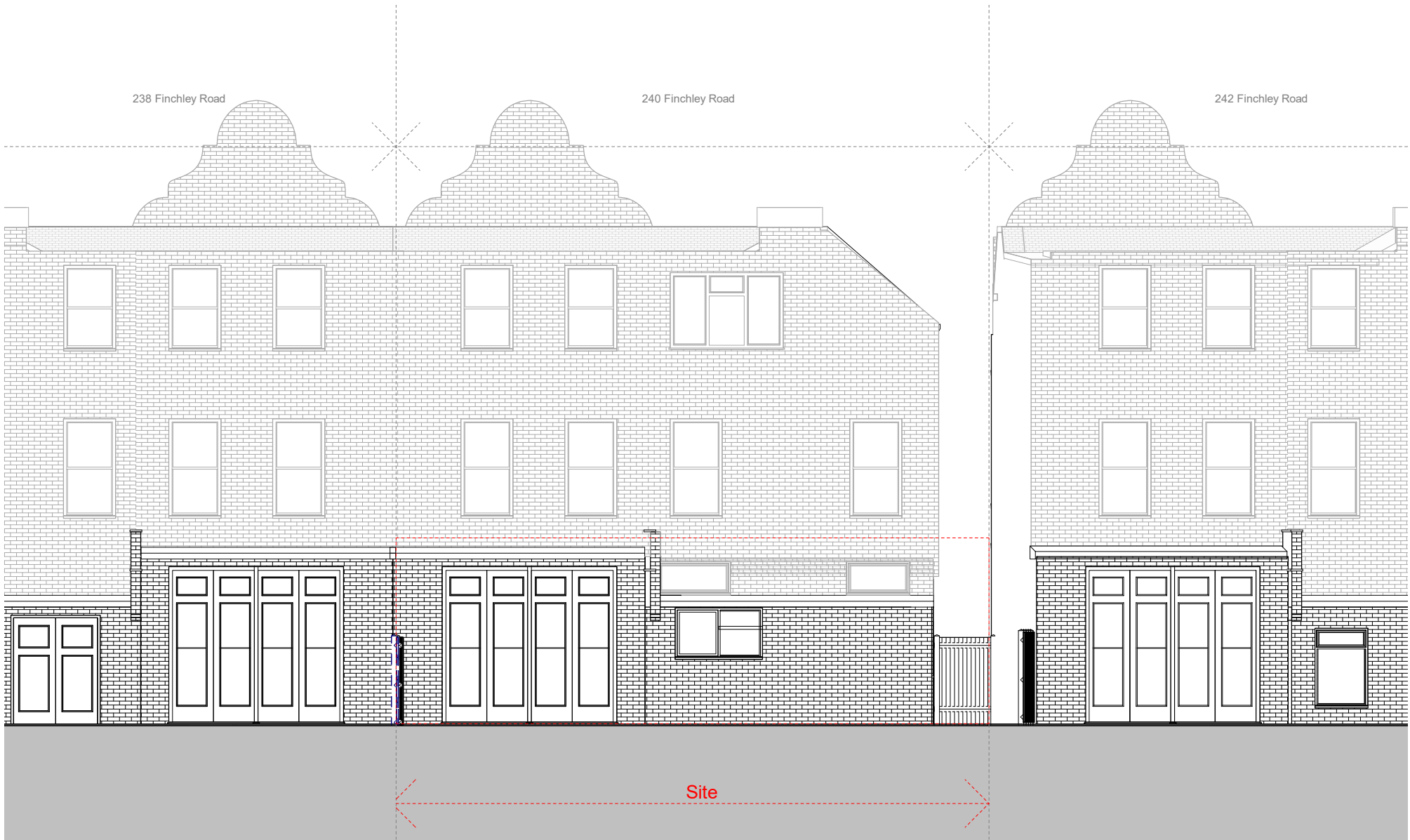
1 Rear Elevation - Existing 1 : 100