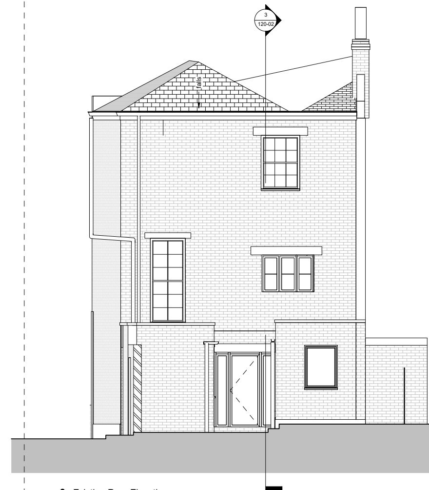
2 Existing Rear Elevation 1:50