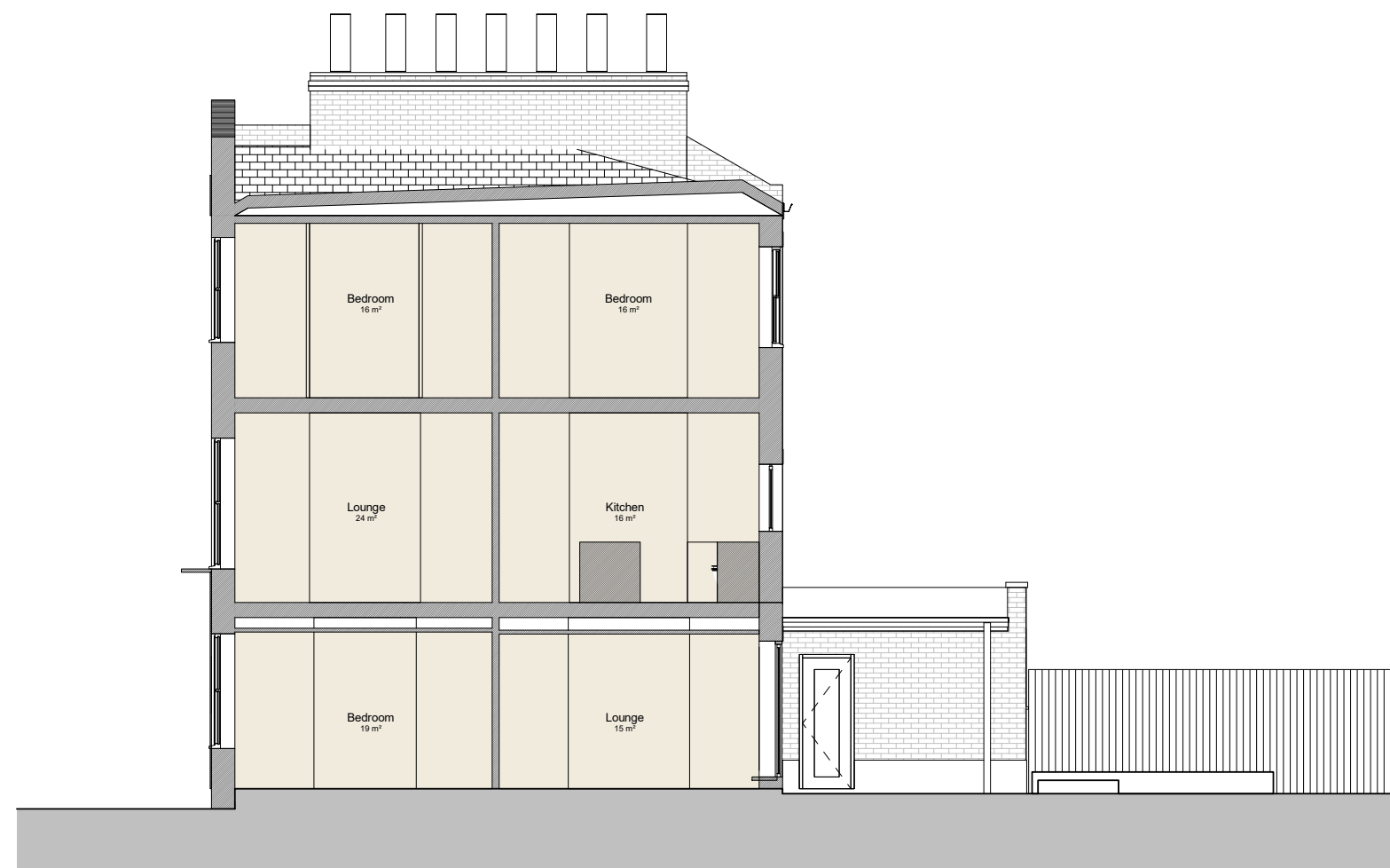
3 Existing Long Section 1:50