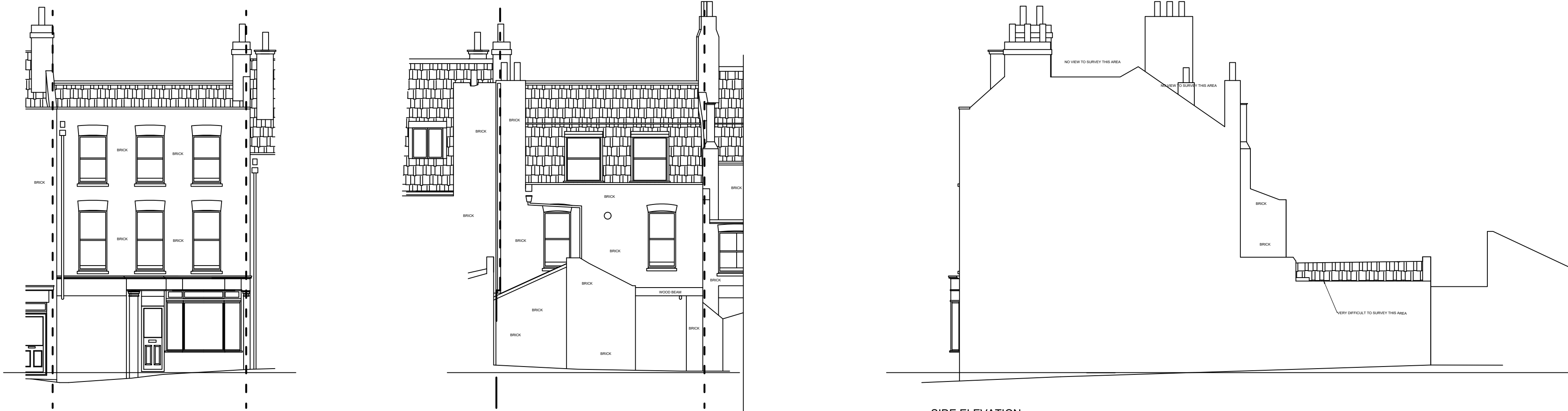
FRONT ELEVATION REAR ELEVATION SIDE ELEVATION