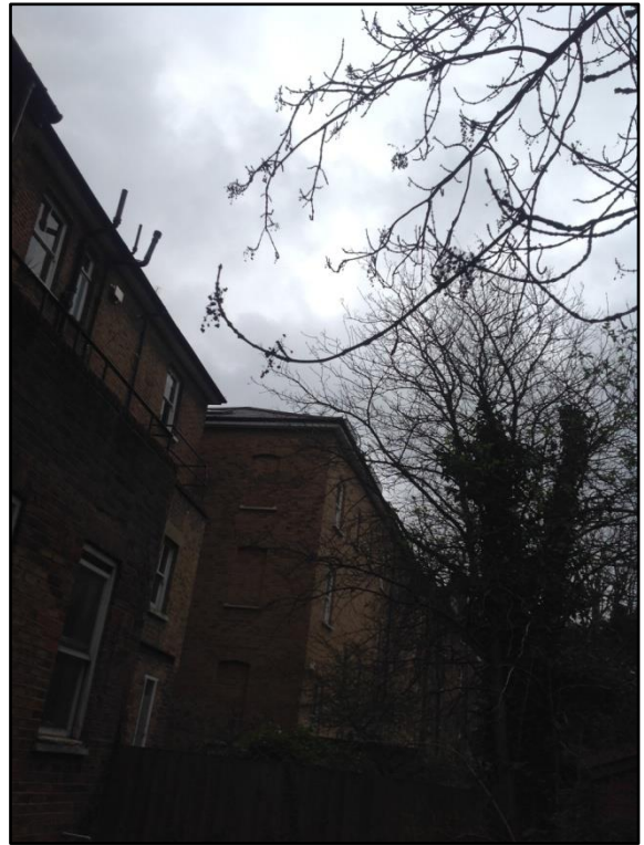
BRANCHES OF THE TREE