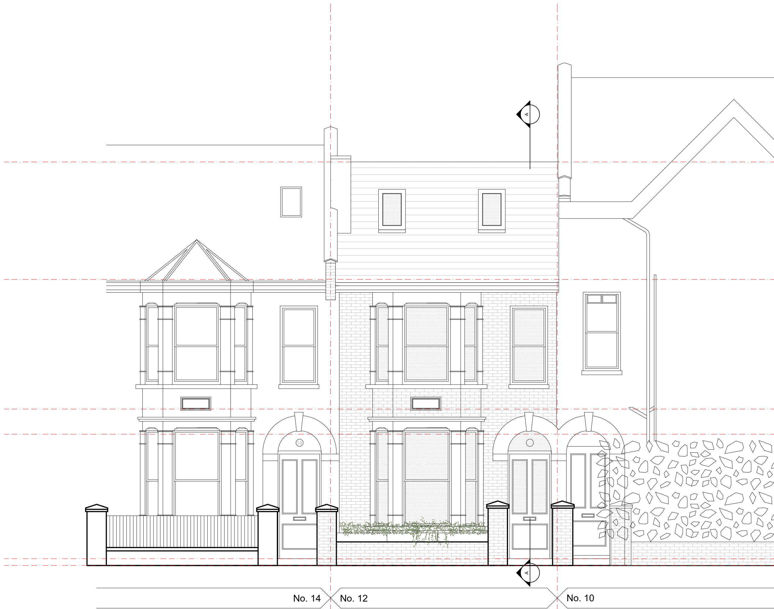
1 SOUTH ELEVATION