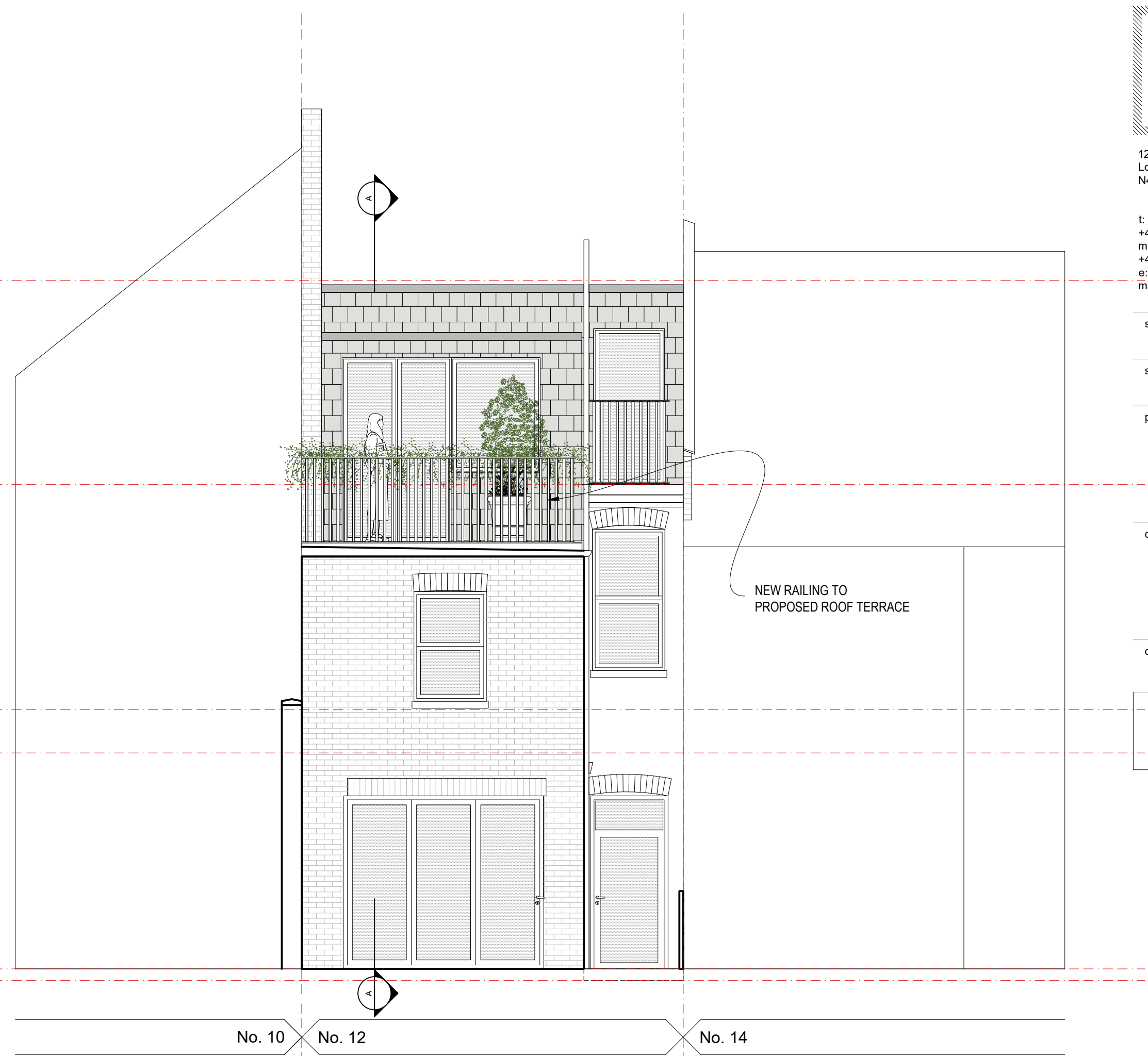
2 NORTH ELEVATION