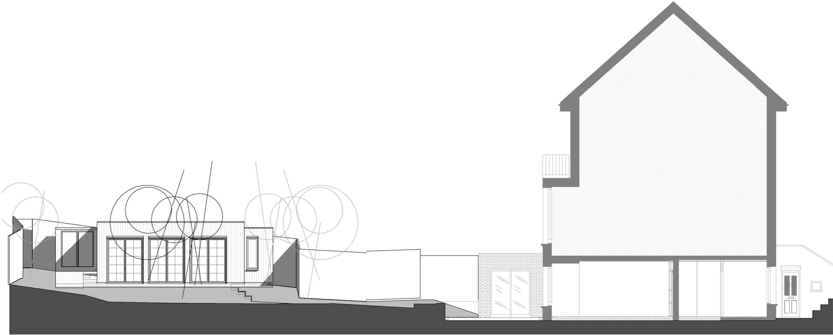
PROPOSED Section BB SCALE 1:100@A3 EX-02