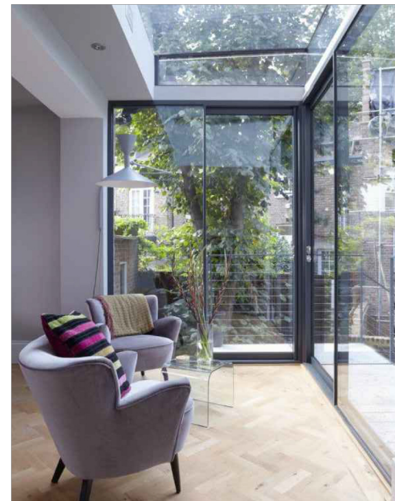
1 Example of structural glass extension