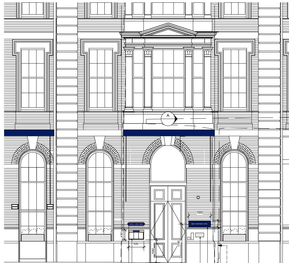
1 PROPOSED ELEVATION Scale: 1:50